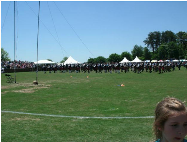
Massed Bands at Greenville Games

We had a good turnout of members at the games but despite efforts to do so, I could not get a replacement for the commissioner position. If you hear of any enthusiastic younger Blair who will take over Commissioner for Northern California please let me know and I will do all I can to help him or her to get off to a good start.