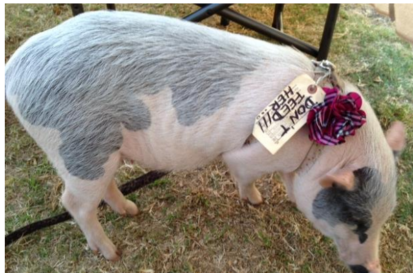
Rosie in Ventura