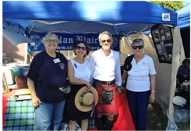
New Members in Ventura