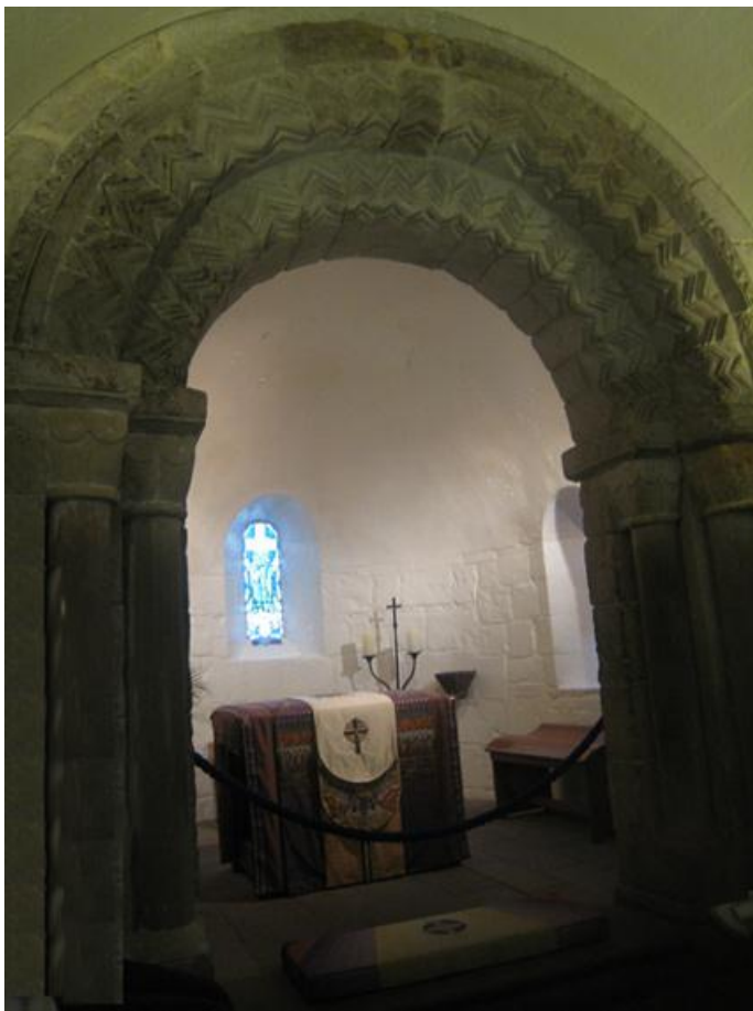
St. Margaret's Chapel in Edinburgh Castle, Dating back to the 1200's