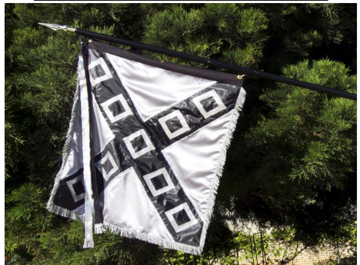
Blair of Blair Flag with Trailing Ribbons 3 feet by 3 feet, hand sewn also

November 5 th , 6 th & 7 th 2010 is the 24 th Annual Tucson Celtic Festival & Scottish Highland Games. It will be held again at Rillito Raceway in Tucson, AZ. This is a big event. We love going to these Games to catch up with our Southern AZ Blairs. www.tucsoncelticfestival.org