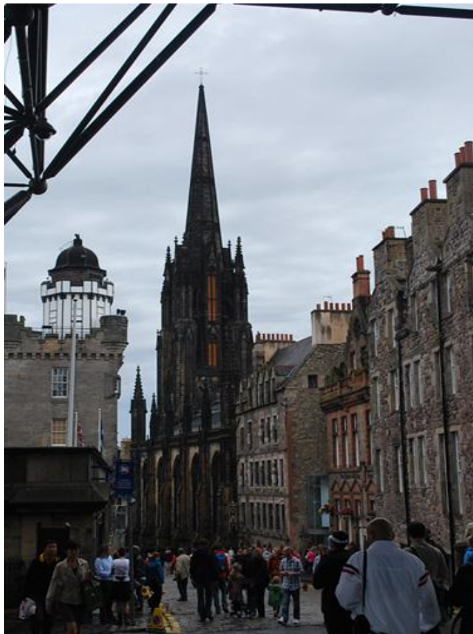
City of Edinburgh