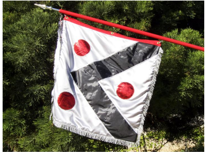
P1000537-a Blair of Balthyock Flag