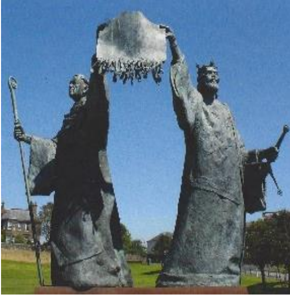
The Monument to the Declaration of Arbroath at Arbroath, Scotland. On the left: Chancellor Bernard Linton and on the right, the King Robert the Bruce.