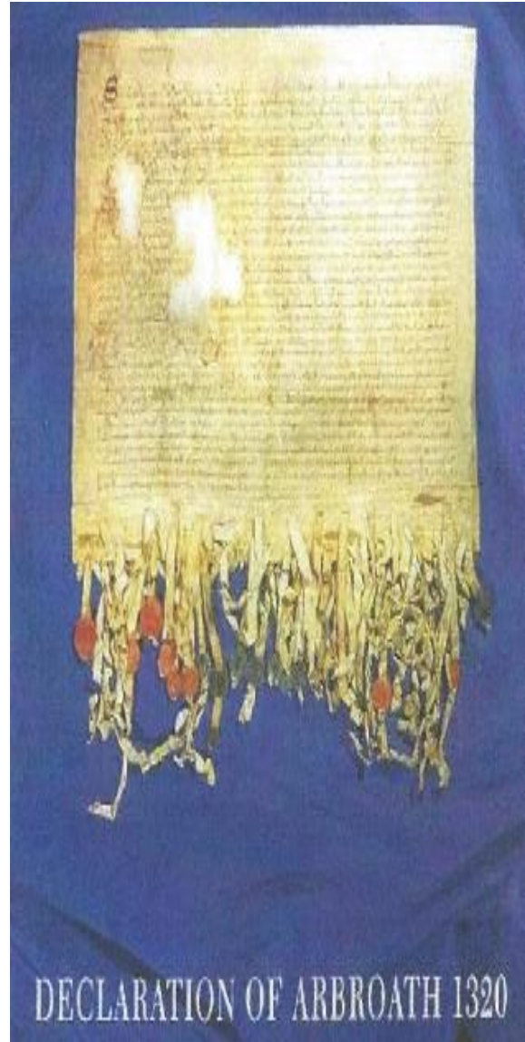
The Declaration of Arbroath. The Strings below it are seals of the 8 Earls and 31 Barons.