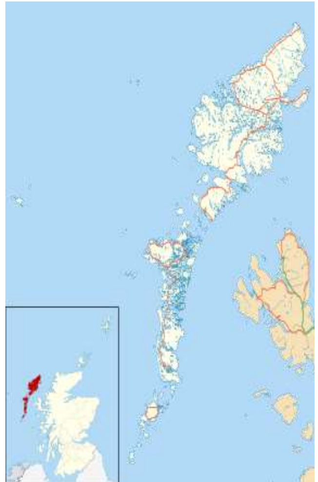
Location of Callanish