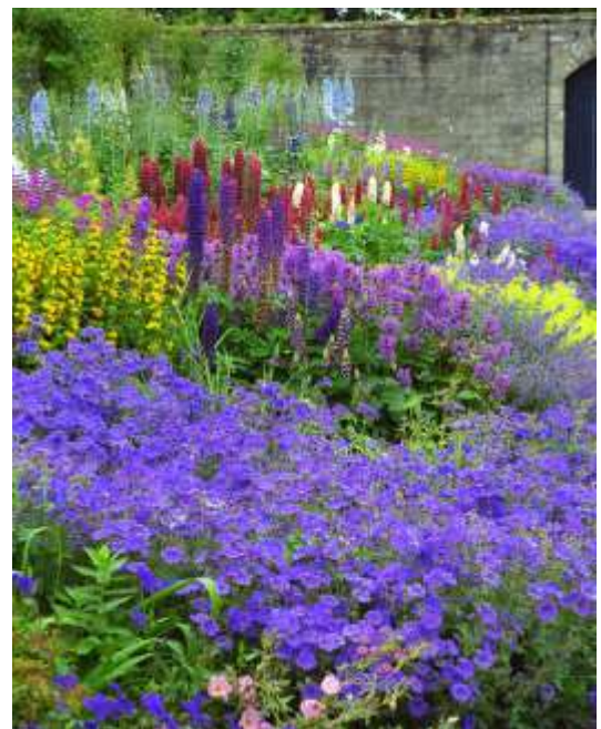
Scottish Garden, Glasgow