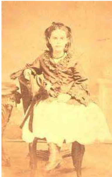
Jean Armour as a young girl

Born in, Ayrshire in 1765, Jean Armour was second oldest of the eleven children of stonemason James Armour (died 1798) and Mary Smith Armour. She met Robert Burns on a drying green in Mauchline around 1784 when she chased his dog away from her laundry. According to Armour's testimony in 1827, she met Burns again at a local dance and they subsequently "fell acquainted".