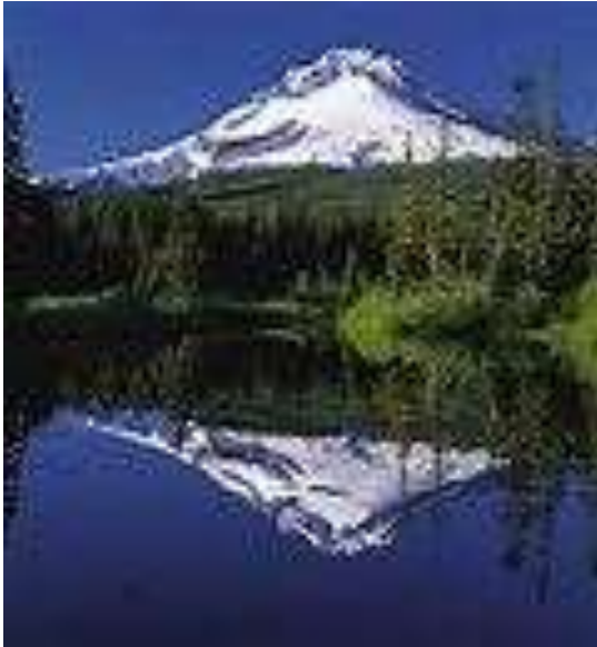
Mount Hood, Oregon