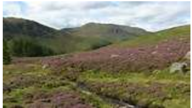
Scotland's hills of heather in bloom