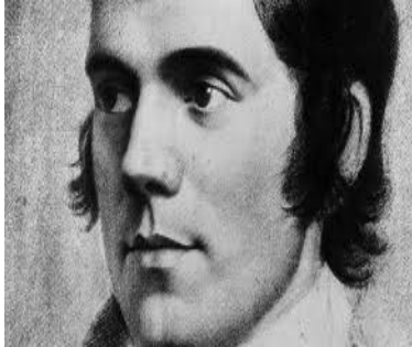
SIR ROBERT BURNS

The Colorado contingent has continued a busy schedule. Following successful festival events in the fall of 2012, the Clan conducted its annual celebration of Sir Robert Burns.