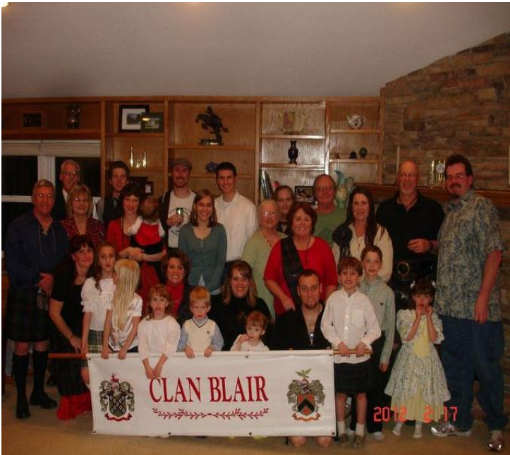
Burns Supper, Colorado Attendees