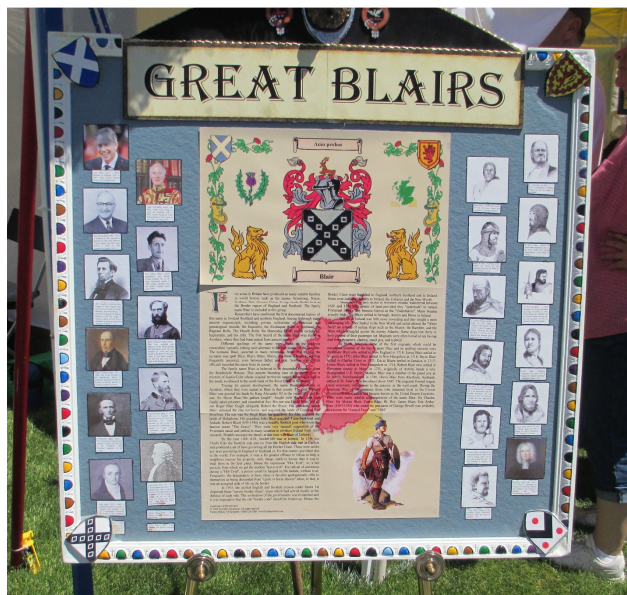
"Great Blair" poster on easel.