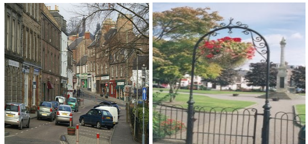
Town Center of Blairgowrie, and Wellmeadow

Blairgowrie and Rattray is a twin burgh in Perth and Kinross, Scotland. People who live in Blairgowrie call it, simply, "Blair." Blairgowrie is the larger of the two former burghs. The Burghs were united by Parliament in 1928. Blairgowrie is on the Southwest side of the River Ericht, and Rattray is on the northeast side. Blairgowrie and Rattray developed over the centuries at the crossroads of several historic routes from other cities, such as Perth, Coupar Angus, Alyth and Braemar. The town's centrepiece is the Wellmeadow, a grassy triangle in the middle of town which hosts regular markets and outdoor entertainment.