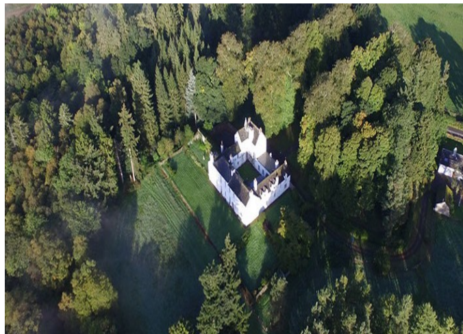
Ardblair Castle, Blairgowrie, Scotland