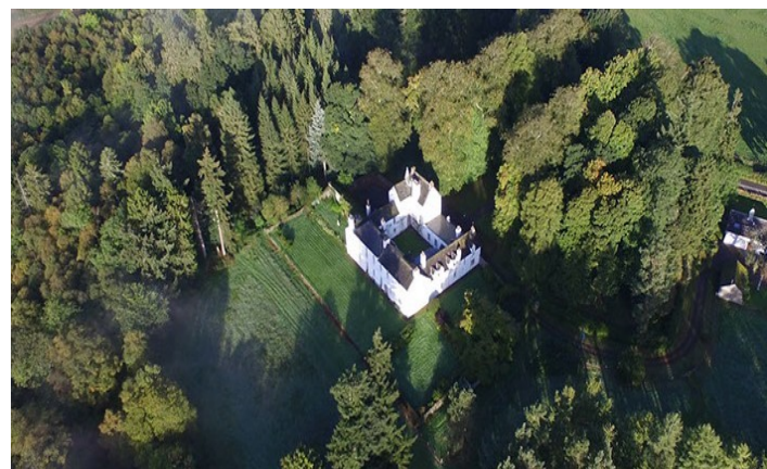
Ardblair Castle is 0.75 miles west of Blairgowrie in Perth and Kinross, Scotland.