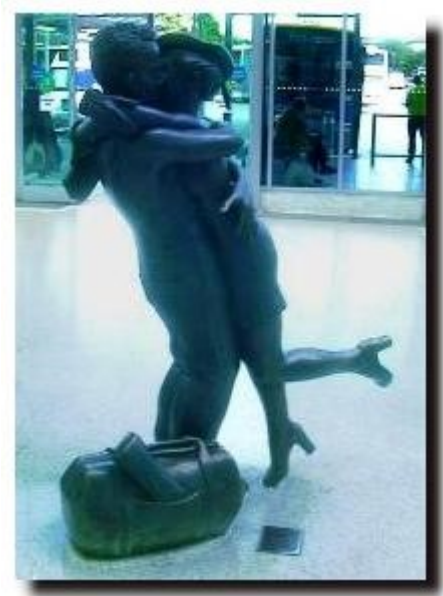
The "Meeting Point" statue in Buchanan Bus Station, Glasgow