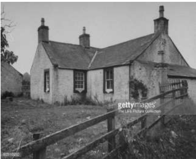
The Farm of Robert Burns