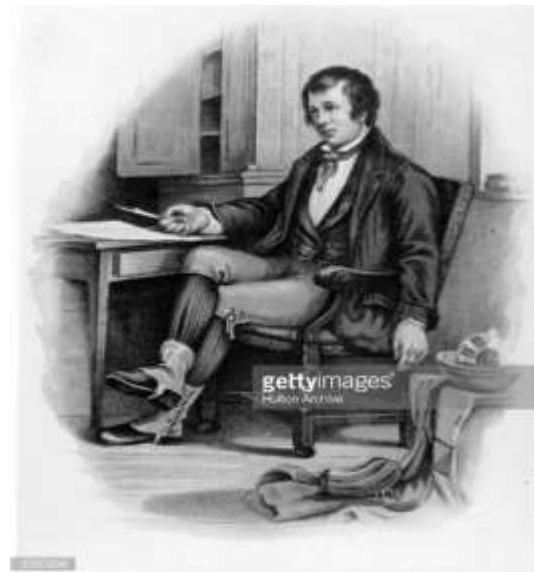
Robert Burns Writing "The Cotter's Cottage"

He wrote over 600 works of poetry and songs. Robert Burns.org has a complete list of his works. Scotland.org/arts has a section where people actually read his works. Much of Burns' work being in Scot, there are translations out there in English. His most well-known works: " Old Lang Syne, To a Louse, My Love is like a Red, Red Rose, Eulogy on the Death of Sir King Humphrey Blair "