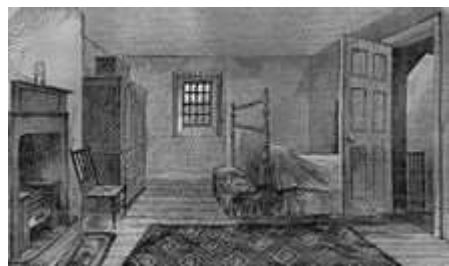
Death Room of Robert Burns

Robbie Burns favored women and liked the whiskey as well. His reputation was large. He fathered 12 children. In 1786, he published his first edition of poetry called “ POEMS ”, written in the Scottish dialect. This book sold out within a month. He married Jean Armour in 1788. They had nine children – four were two sets of twins. The last child was actually born on the day of his funeral.