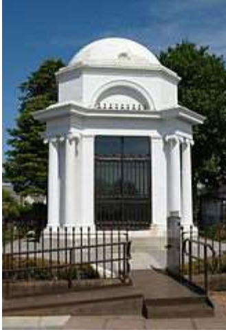
Robert Burns Mausoleum at St. Michael's churchyard in Dumfries.