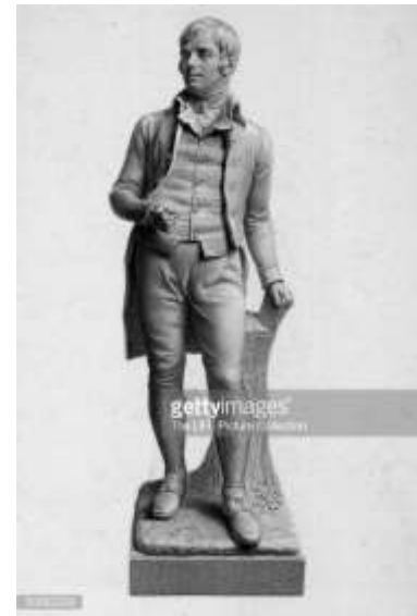
Statue of Robert Burns, Glasgow, Scotland