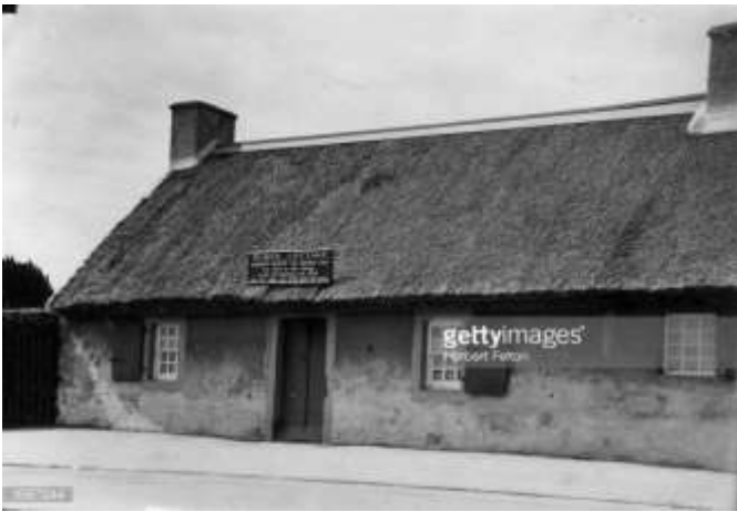
The thatched home where Robert Burns was born