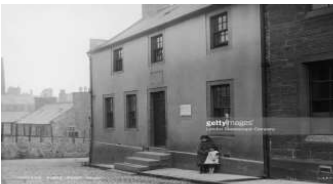
The Home in Which Robert Burns died