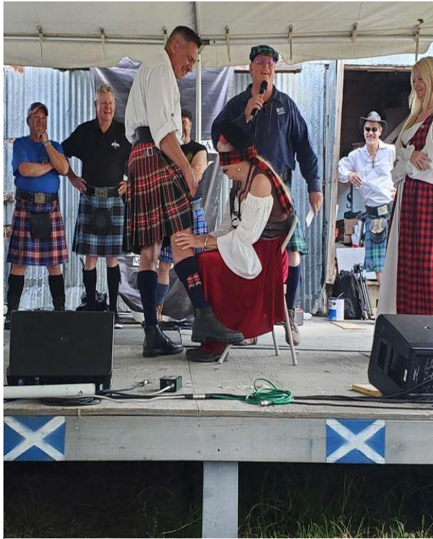
Bonnie knees contest