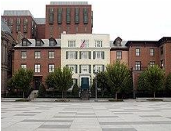
Blair House, 1651 Pennsylvania Avenue