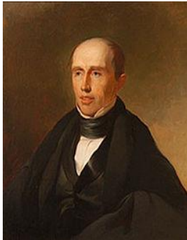
Francis Preston Blair, 1845