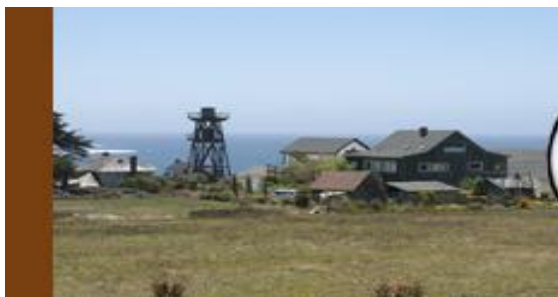
Early Blair House