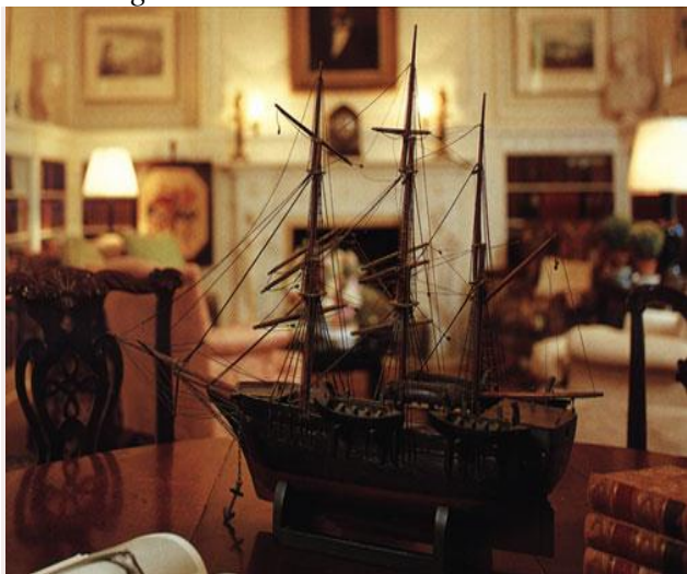
Blair House has been a part of American and world history