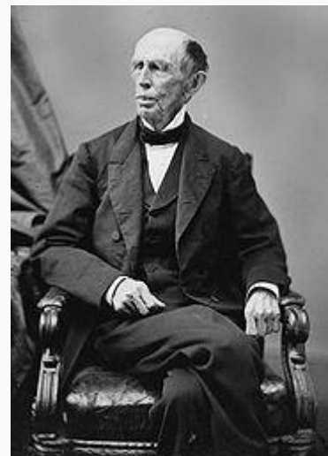
Blair c. 1870

Born April 12, 1791 Abingdon, Virginia Died October 18, 1876 (aged 85) Silver Spring, Maryland , U.S. Alma mater Transylvania University