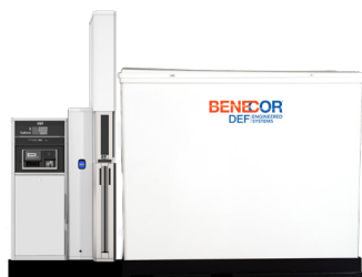
1-SIDED - LEFT OR RIGHT