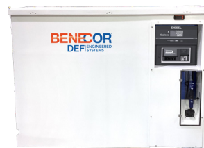
1-SIDED - LEFT OR RIGHT

BENECOR® RETAIL UNIT WITH WAYNE SELECT S1 DISPENSER