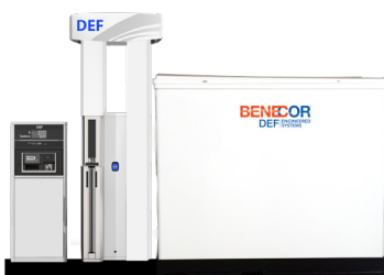
2-SIDED - LEFT & RIGHT