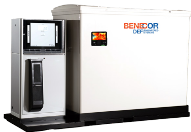
1-SIDED - LEFT OR RIGHT

BENECOR® RETAIL UNIT WITH GASBOY ATLASX DISPENSER