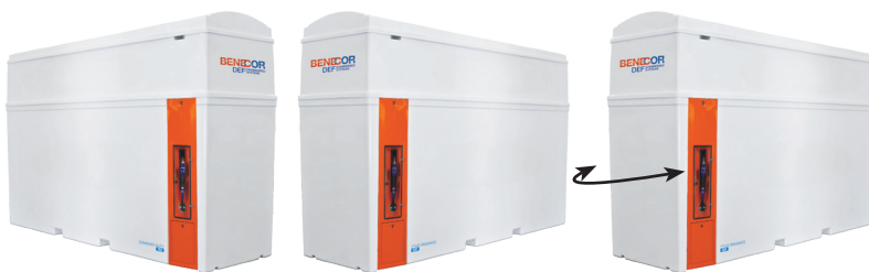
1-SIDED - LEFT