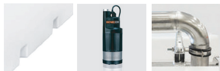
FORKLIFT ACCESSIBLE FOR SAFE & EASY LOADING