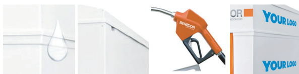
FULLY SEALED HOUSING

All BENECOR® DEF Mini-Bulk Dispensing & Storage Systems meet the ISO 22241-3 & 4 standards for the dispensing and storage of DEF.