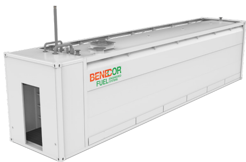
37" PUMP ROOM