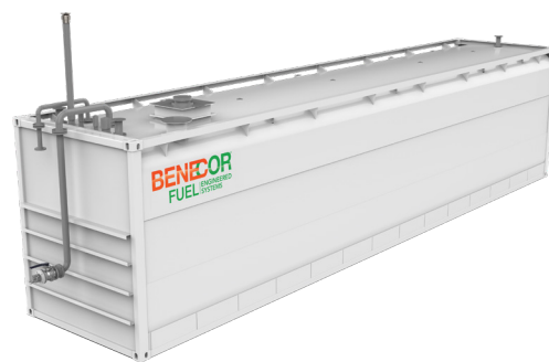
WITHOUT PUMP ROOM