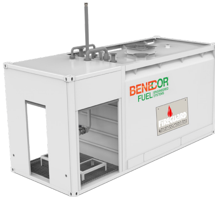
63" PUMP ROOM