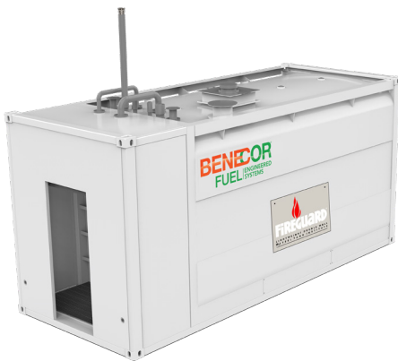
37" PUMP ROOM