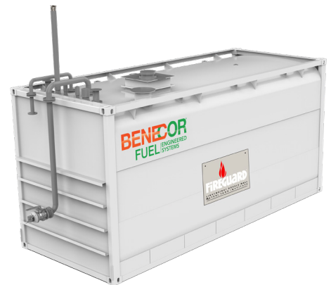
WITHOUT PUMP ROOM