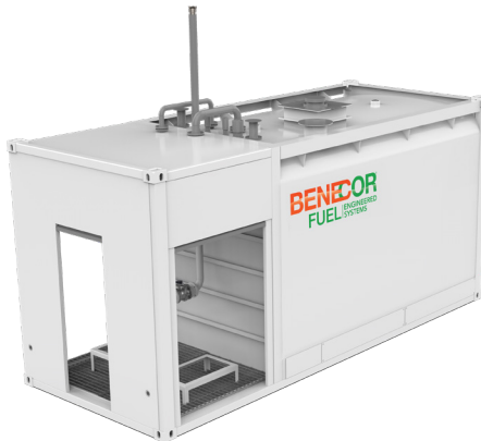
63" PUMP ROOM