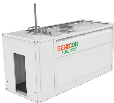
37" PUMP ROOM