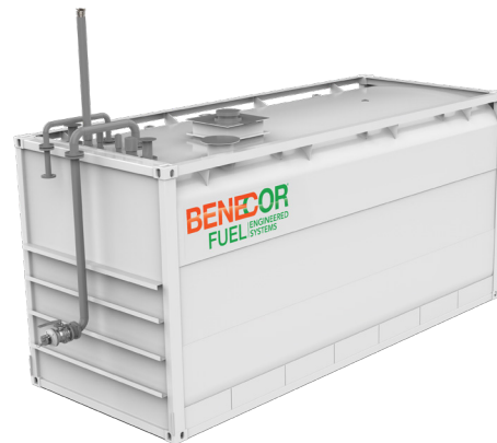
WITHOUT PUMP ROOM