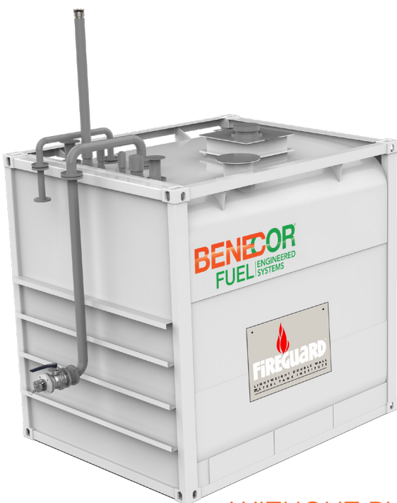
WITHOUT PUMP ROOM

FOR MORE INFORMATION CONTACT BENECOR DIRECTLY