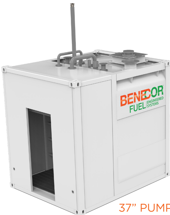
37" PUMP ROOM