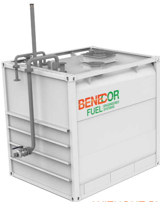
WITHOUT PUMP ROOM

FOR MORE INFORMATION CONTACT BENECOR DIRECTLY