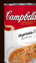
Vegetable #682757, 12/50 oz