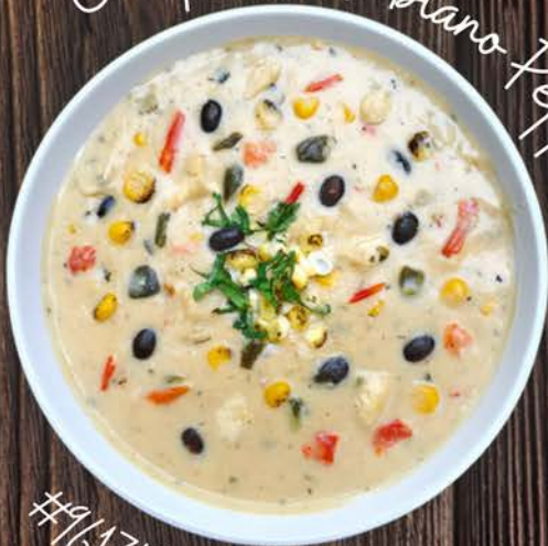
Chicken & Poblano Pepper