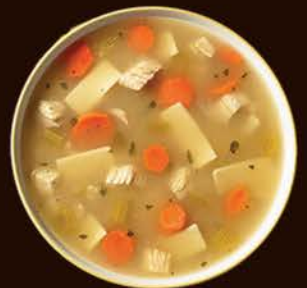
Chicken Noodle #400717, 4/4 lb