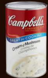
Cream of Mushroom #471237, 12/50 oz