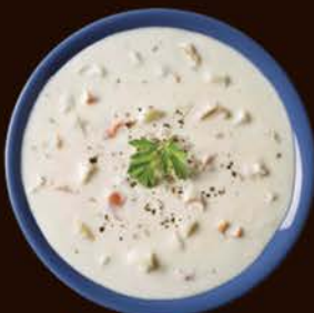
New England Clam Chowder #400722, 4/4 lb Gluten Free