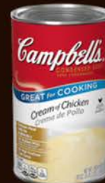
Cream of Chicken #471235, 12/50 oz