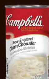
New England Clam Chowder #471238, 12/50 oz