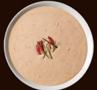
Maine Lobster Bisque #400716, 4/4 lb