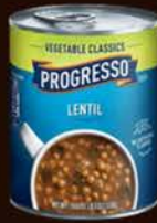
Lentil Soup #471212, 12/19 oz