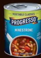
Minestrone Soup #63545, 12/19 oz