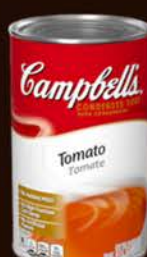
Tomato #471234, 12/50 oz