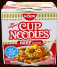
Cup of Noodles, Beef #900368, 12/2.5 oz