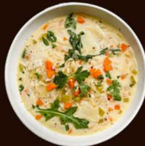
Chicken Lemon & Orzo #400826, 4/4 lb ABF, Low Fat