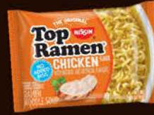
Top Ramen Chicken #471285, 24/3 oz