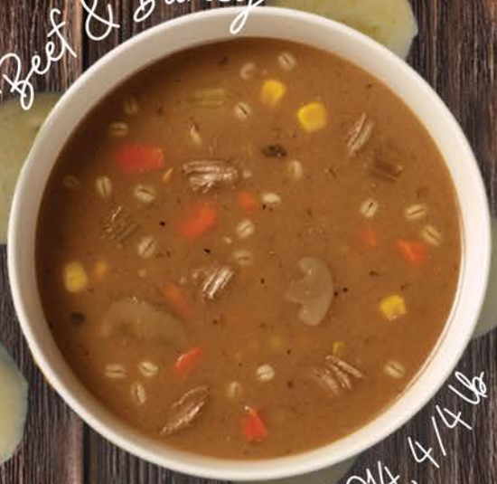
Beef & Barley