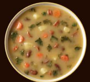
Turkey Sausage & Kale #400721, 4/4 lb Gluten Free