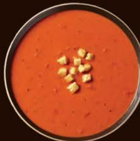
Creamy Tomato #400719, 4/4 lb Gluten Free