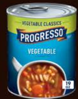
Vegetable Soup #471201, 12/19 oz