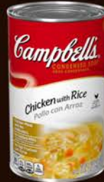
Chicken with Rice #471241, 12/50 oz