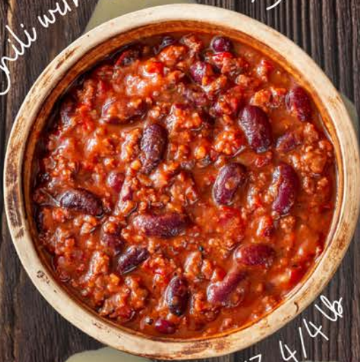
Beef Chili with Beans (GTF)