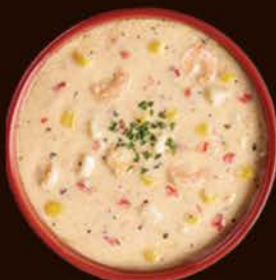
Shrimp & Roast Corn Chowder #400715, 4/4 lb