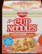
Cup of Noodles, Chicken #900357, 24/2.5 oz