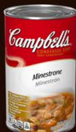
Minestrone #471231, 12/50 oz