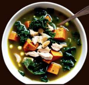
Chicken & Kale with Sweet Potato #400740, 4/4 lb Gluten Free