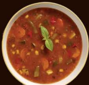
Minestrone #700742, 4/4 lb Vegetarian, Low Fat, Dairy Free