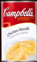
Chicken Noodle #471243, 12/50 oz