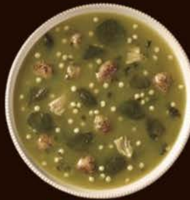
Italian Wedding Meatball #400749, 4/4 lb