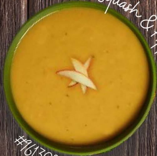
Butternut Squash & Apple