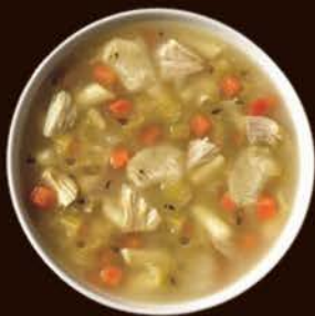
Chicken & Dumpling #400760, 4/4 lb ABF