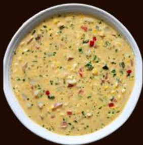
Corn Chowder Southwest #400751, 4/4 lb