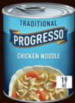
Chicken Noodle Soup #471211, 12/19 oz