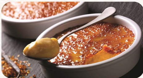
#684512, 8/1 ct Bindi