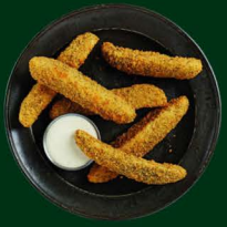
Breaded Dill Pickle Spears 4/4 lb, Anchor #801614