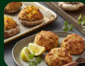
Tavern Crab Cake 3 oz Phillips, 1/4.5 lb #960907