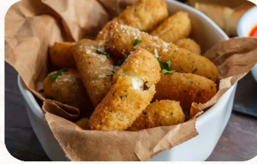
#801703, 50/1.75 oz, Mad Mutz