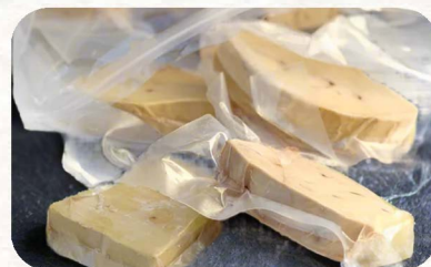
#870506, 16/2 oz, Hudson Valley