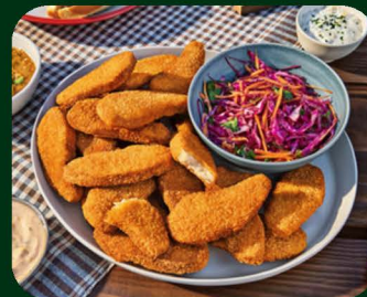
Impossible Chicken Tenders #111745, 1/10 lb, Impossible