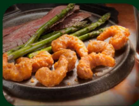
Guinness Beer Battered Shrimp 26/30 Icelandic, 1/10 lb #801808