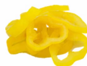
Banana Pepper Rings