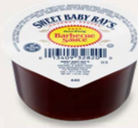
Original BBQ Sauce #160533, 100/1.25 OZ