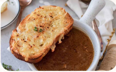
#400704, 4/4 lb, Blount