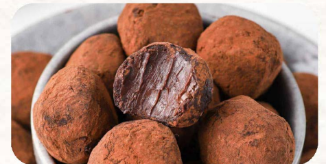
#685035, 15/7 oz, Paris Gourmet