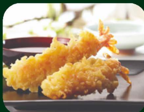
Shrimp Tempura 21/25 Tail On Aqua Star, 4/2.5 lb #480537