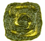
Basil Pesto Sauce