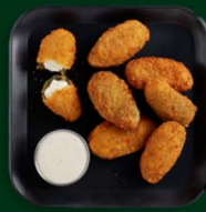
Jalapeno Popper Cream Cheese 4/3 lb, Starting Line #861005