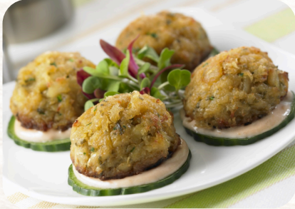
#960906, Phillips, 100/.75 oz