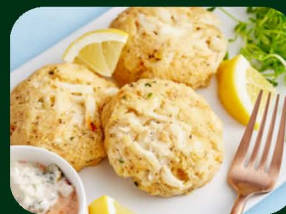
Ultimate Crab Cake Handy, 24/3 oz #480434