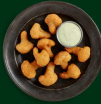
Battered Cauliflower 6/48 oz, Anchor #801502