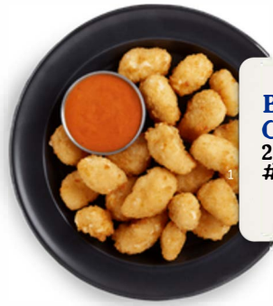
Breaded Cheddar Cheese Curds 2/5 lb, Anchor #801638