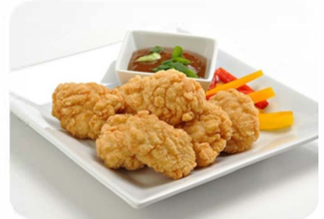
Boneless Chicken Wing Fritter Raw #681476, 2/5 LB, Koch