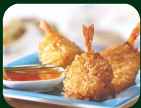
Coconut Panko Breaded Butterfly Shrimp 16/20 Ocean Horizon, 4/3 lb #300222