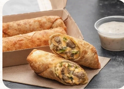
#340846, 36/3 oz, Minh