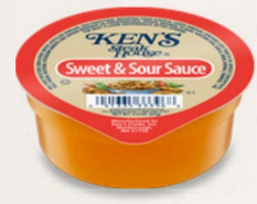
Sweet & Sour Sauce Cup #190966, 100/1 OZ