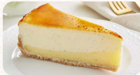
#970416, 2/5 lb, Sweet Street