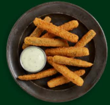
Italian Breaded Zucchini Sticks 4/3.5 lb, Anchor #801604