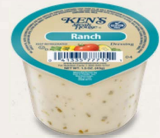
Homestyle Ranch Cups #160055, 100/1.5 OZ