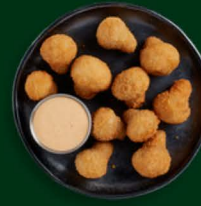
Breaded Mushrooms 6/2.5 lb, Anchor #801602