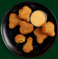
Breaded Broccoli Cheddar Bites 6/2.5 lb, Anchor #801603