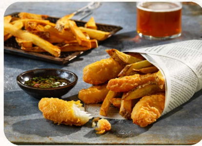
#960009, 80/2 oz, Brewers