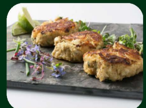
Seafood Cake (Shrimp, Crab, Scallop) 3 oz Stone Silo, 4/6 lb, #970002