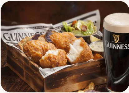
#801804, 1/10 lb, Icelandic