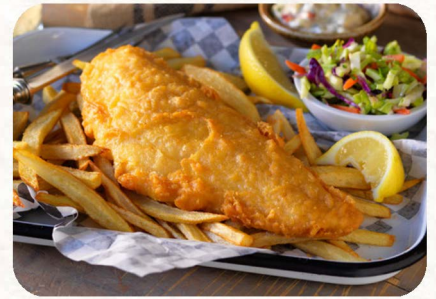
#190826, 1/20 lb, Icelandic