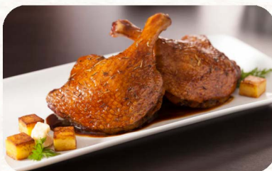
#006794, 2/12ct, Maple Leaf