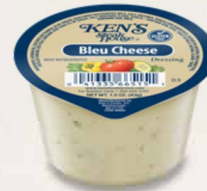
Blue Cheese Cups #160039, 100/1.5 OZ