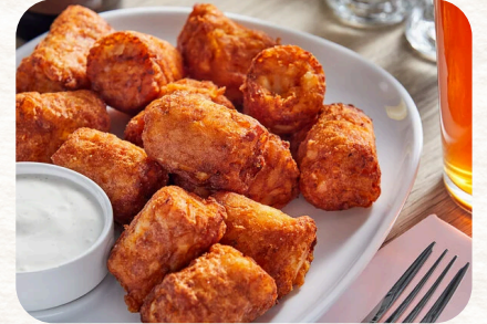
#700901, 1/10 lb, Stone Gate