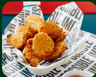
Impossible Chicken Nuggets #111739, 114/.71 oz, Impossible