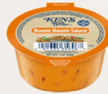
Boom Boom Sauce #684899, 100/1 OZ