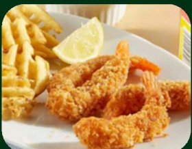
Jalapeno Breaded Shrimp Handy, 2/50 ct #480435