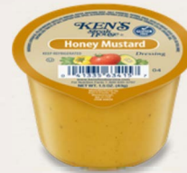
Honey Mustard Cups #160082, 100/1.5 OZ