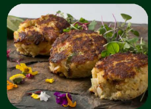
Spinach Parmesan Crab Cake Stone Silo, 64/3 oz #300455