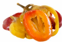
Hot Cherry Peppers Sliced