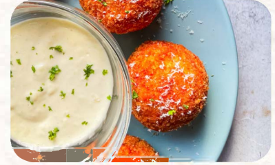
#400400, 2/5 lb, Koch