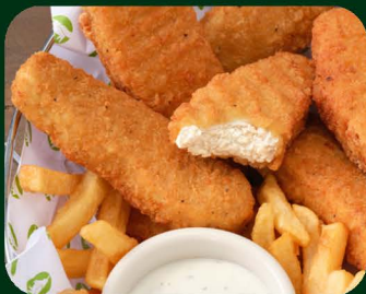
Vegan Chicken Tender #111737, 1/10 lb, Beyond