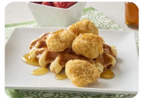
Homestyle Chicken Breast Chunk Fritter FC #410093, 1/10 lb, Tyson