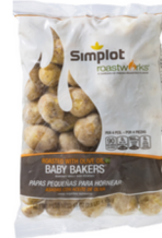
POTATO ROASTED RED W/ ROSEMARY SIMPLOT 6/2.5 LB #831501