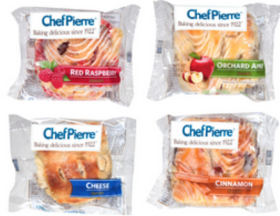
DANISH ASST IW 3OZ T&S CHEF PIERRE 24/3 OZ #922399