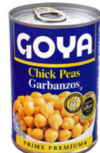
GARBANZO BEAN GOYA 24/15.5 OZ #920597