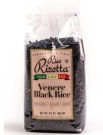
RICE BLACK ITALIAN UNCLE BENS 6/17.6 OZ #130020