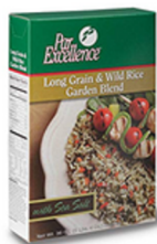
RICE LONG GRAIN AND WILD PRODUCER 6 / 36 OZ #422004