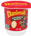
DANIMALS STRAW BANANA DANNON YOGURT 48/4 OZ #041011