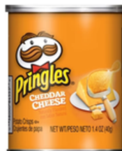
PRINGLES CHEDDAR 12/1.4 OZ #441050