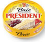
CHEESE BRIE PLAIN PRESIDENT 2/2 LB, #030207