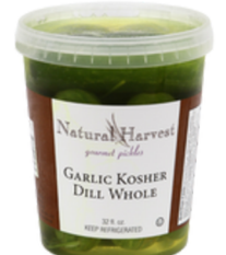
KOSHER DILL WHOLE HARVEST PICKLE 12/32 OZ #391547