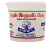
CHEESE MOZZARELLA BUFFALO BALL LUPARA 12/7 OZ #521210