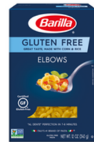
PASTA ELBOW MACARONI GF BARILLA 8/12 OZ #371106