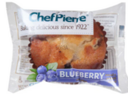
MUFFIN BLUEBERRY IW CHEF PIERRE 24/4 OZ # 910048