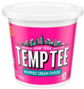
CHEESE CREAM TEMPTEE 12/8 OZ #41211