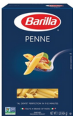
PASTA PENNE BARILLA 12/16 OZ #372086