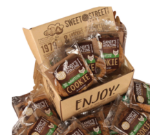
COOKIE IW CHOC CHUNK MANIFESTO SWEET STREET 48/3.02 OZ #160581