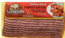
TURKEY BACON SMOKED SLICED GODSHALLS 12/12 OZ #780111