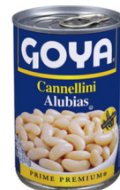
CANNELLINI BEAN WHITE GOYA 24/15.5 OZ #983650