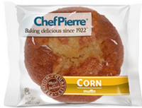
CORN MUFFIN IW CHEF PIERRE 24/4 OZ #924811