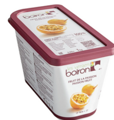
PASSION FRUIT PUREE BOIRON 6/2.2 LB #845103