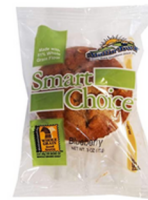
MUFFIN IW WGR BLUEBERRY RDF MUFFINTOWN 96/2 OZ #924825