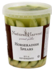
HORSERADISH SPEAR PATRIOT PICKLE 12 / 32 OZ #391550