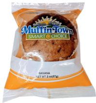
MUFFIN BANANA IW RDF MUFFINTOWN 96/2 OZ #924822