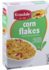
CRISPY RICE BOXED KRASDALE CEREAL 12/12 OZ, #174960