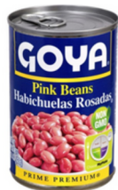
BEANS PINK GOYA LRS, 24/15.5 OZ, #920595 24/15.5 OZ, #532404