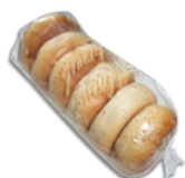
ROCKLAND BAGEL PLAIN 1/6 CT #120165 CINNAMON RAISIN 1/6 CT #120175