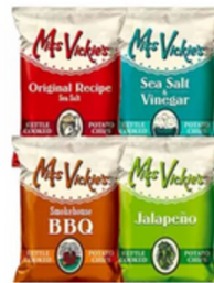
CHIPS LSS POTATO VARIETY PK MISS VICKI 60/1.375 EA #443614