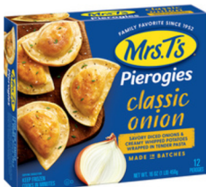
PIEROGIES ONION POTATO MRS. T'S 12/12 CT #949032