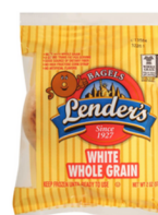
BAGEL WGR IW LENDERS 72/2 OZ #010416