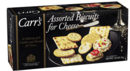
BISCUITS ASSORTED CARRS 12/7.05 OZ #152535