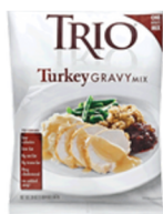
GRAVY TURKEY BASE TRIO 8 / 20 OZ #231209