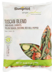
VEGGIE BLEND TUSCAN SIMPLOT 8/3 LB #700231