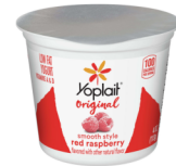
VARIETY RASPBERRY PEACH YOPLAIT YOGURT 48/4 OZ #061264