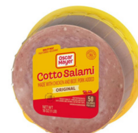
COTTO SALAMI SLICED 12/12 OZ #780182