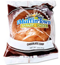
MUFFIN WGR CHOC CHIP IW MUFFINTOWN 48/3.6 OZ #924834