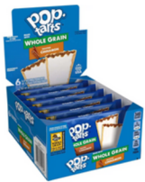
POPTART BROWN SUGAR CINNAMON FROSTED KELLOGGS 72/2 CT #110220