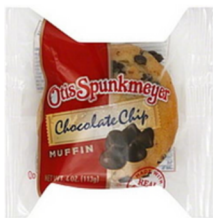
MUFFIN CHOC CHIP IW 4OZ OTIS SPUNKMEYER 24/4 OZ #920628