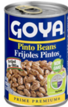
PINTO BEANS LRS, GOYA 24/15.5 OZ #920598