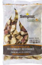
POTATO HALVES RST BABY W/HERBS SIMPLOT, 6/2.5 LB #479156