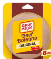
BOLOGNA BEEF SLICED 6/1 LB #780127