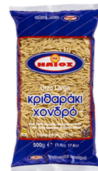
ORZO GREEK KONTOS 12/16 OZ #372023