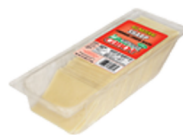
WHITE CHEDDAR SLICED CABOT 4/2.5 LB, #031028