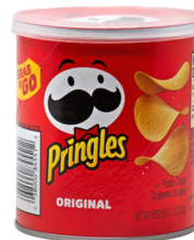
PRINGLES ORIGINAL 12/1.4 OZ #441043