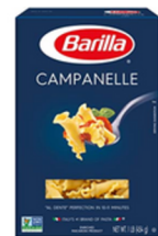
PASTA CAMPANELLE BARILLA 12/16 OZ #372010