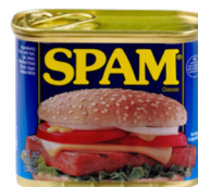
SPAM REDUCED SALT 12/12 OZ #039242