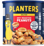
PEANUTS DRY ROASTED SALTED PLANTERS 6/52 OZ #341214