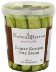
GARLIC DILL SPEAR HARVEST PICKLE 12 / 32 OZ #391545