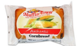
LOAF WGR MINI CORNBREAD IW MUFFIN TOWN 72/2 OZ #924819