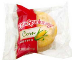
MUFFIN CORN IW OTIS SPUNKMEYER 24/4 OZ #920627