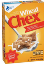
CHEX CEREAL GENERAL MILLS 10/14 OZ, #261410