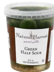
PICKLE GREEN HALF SOUR HARVEST 12 / 32 OZ # 391548