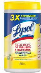
WIPES DISINFECTING LYSOL 6/80 CT, #600612