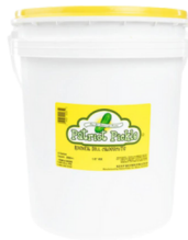
PICKLE SWEET CANDIED CHIPS PATRIOT PICKLE 12 / 32 OZ # 391576