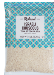
COUSCOUS ISRAELI ROLAND 4/5 lb, #421005