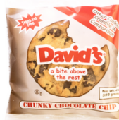
CHOCOLATE CHUNK T&S DAVIDS COOKIE 32/4 OZ #921029