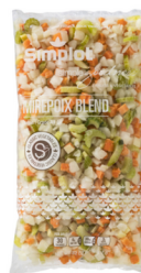
VEG BLEND MIREPOIX DICED FRZN SIMPLOT 12/2 LB #099589