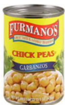
GARBANZO BEAN FURMANO 24/15.5 OZ, #073859