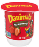
DANIMALS STRAWBERRY DANNON YOGURT 48/4 OZ #041012