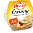
CHEESE BRIE SPREAD PRESIDENT 2/3.25 LB #030232