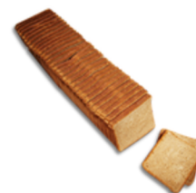
ROCKLAND PULLMAN WHEAT 1/LOAF #120078 WHITE 1/LOAF #120072