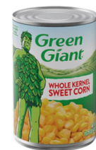
CORN WHOLE KERNEL SWEET GREEN GIANT 24/ 15.3 OZ #530777