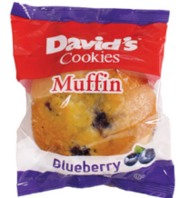
MUFFIN BLUEBERRY CRUMB DAVIDS 12 / 6 OZ #921133