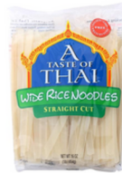
RICE NOODLES THIN A TASTE OF THAI 6/1 LB #561360