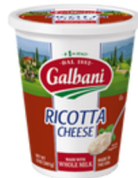
RICOTTA CHEESE WM GALBANI 6/3 LB, #35014