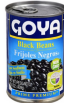
BLACK BEANS LRS GOYA 24/15.5 OZ #920596