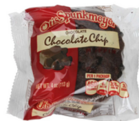
MUFFIN IW CHOC CHOC CHIP OTIS SPUNKMEYER 24/4 OZ #920630