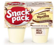
PUDDING VANILLA FFR SNACK PACK 12/4 PCK #411234