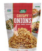
ONION CRISPY FRIED FRESH GOURMET 6 / 24 OZ #340683