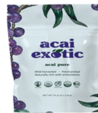
ACAI PURE ORIGINAL ACAI EXOTIC 15/14 OZ #854163