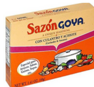
SAZON ORIGINAL GOYA 24/12 ENVL #920572