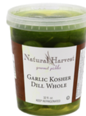
GARLIC DILL CHIPS KOSH HARVEST PICKLE 12 / 32 OZ #391546