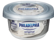
CREAM CHEESE SOFT PHILADELPHIA 12/8 OZ, #41202