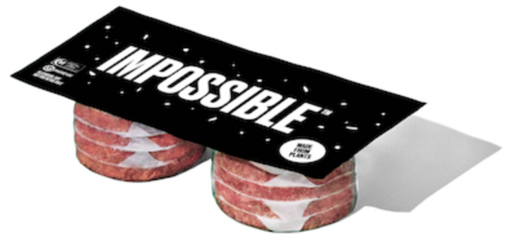
BURGER MEATLESS PATTIES BEYOND MEAT 40/4 OZ #878309