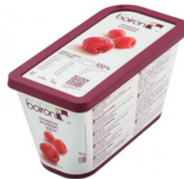
RASPBERRY PUREE BOIRON 6/2.2 LB #845030