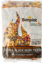
CORN & BLACK BEANS ROASTED SIMPLOT, 6/2.5 LB #883114