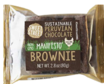
BROWNIE SUSTAINABLE PERUVIAN CHOCOLATE SWEET STREET 48/2.88 OZ #920109