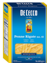
PASTA PENNE RIGATE DECECCO 12/1 LBS #371220