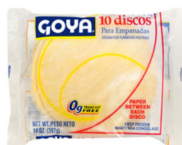
DOUGH EMPANADA WHITE 5 GOYA 24/14 OZ# 931004