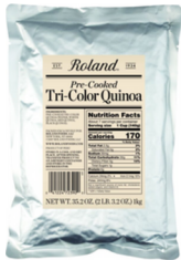
TRI COLOR QUINOA PRE-COOKED ROLAND 6/1 KG #551217