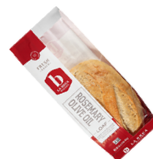
BREAD PB ROSEMARY OLIVE OIL LA BREA 12/18 OZ #120264