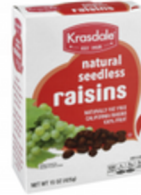
RAISINS SEEDLESS NATURAL KRASDALE 24/15 OZ #790500