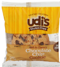
FTD IW CHOC CHIP UDIS COOKIE 36/1.7 OZ #960651