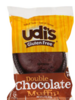
GTF IW DBL CHOC UDIS MUFFIN 36/3 OZ #960650