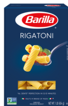
PASTA MEZZI RIGATONI BARILLA 12/16 OZ #371256