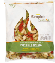
PEPPER ONION BLEND FLAMEROAST SIMPLOT 6/2.5 LB #833088