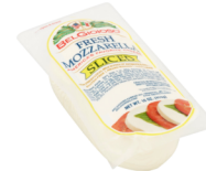
MOZZARELLA FRESH SLICED BELGIOIOSO 8/1 LB, #030607