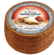
CHEESE MANCHEGO CURADO WHEELS PRESIDENT 2/6.6 LB, #3208