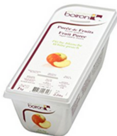
WHITE PEACH PUREE BOIRON 6/2.2 LB #845105