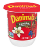
DANIMALS VANILLA DANNON YOGURT 48/4 OZ #041010