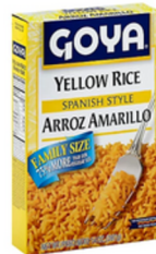
RICE YELLOW GOYA 18/14 OZ #421801