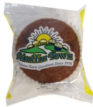
MUFFIN BRAN WW IW MUFFINTOWN 96/2 OZ #909482