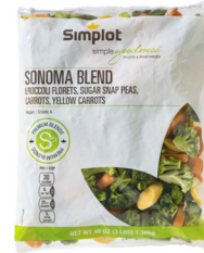
VEGGIE BLEND SONOMOA SIMPLOT 8/3 LB #941500