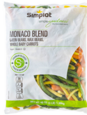
VEG MONACO BLEND SIMPLOT 8/3 LB #700231