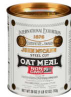
OATMEAL IRISH MCANN 12/28 OZ, #264615