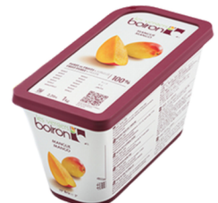
MANGO PUREE BOIRON 6/2.2 LB #845014