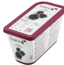
BLACKBERRY PUREE BOIRON 6/2.2 LB #845106