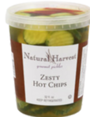
HOT AND ZESTY CHIP HARVEST PICKLE 12 / 32 OZ # 391549