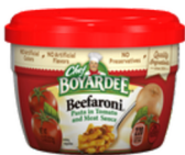
BEEFARONI CHEF BOYARDEE 12/7.5 OZ #531209