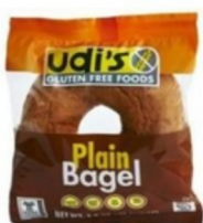
IW PLAIN GTF UDIS BAGEL 72/2 OZ #960634