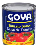
TOMATO SAUCE GOYA 48 / 8 OZ #524802