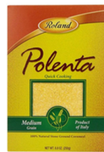
POLENTA YELLOW QUICK COOK ROLAND 12/8.8 OZ, #205049