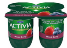
ACTIVIA MIXED BERRY DANNON YOGURT 24/4 OZ #001975