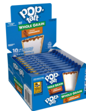
POPTART BROWN SUGAR WGR 12/10 KELLOGGS 12/10 CT #110224