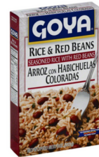
RICE & RED BEANS GOYA 24 / 8 OZ #422401