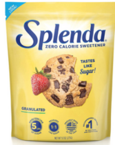
SPLENDA SUGAR SUBSTITUTE SPLENDA 8/9.7 OZ #491202