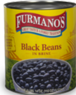
BLACK BEANS FURMANO 6/#10 #530706