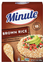
RICE BROWN WGR INSTANT MINUTE 12/14 OZ #422513