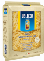
PASTA FETTUCCINE NEST DECECCO 12 / 8.8 OZ #372096