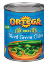
CHILIS GREEN DICED ORTEGA 12 / 26 OZ #390619