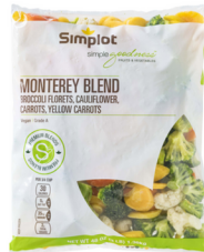
VEGGIE BLEND MONTEREY SIMPLOT 8/3 LB #941508