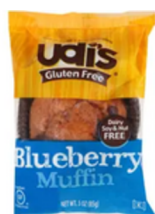
GTF IW BLUEBERRY UDIS MUFFIN 36/3 OZ #960649