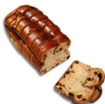
BREAD CINNAMON RAISIN SLICED ROCKLAND 1/LOAF #120146