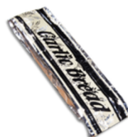
BREAD GARLIC ROCKLAND 1/LOAF #120339