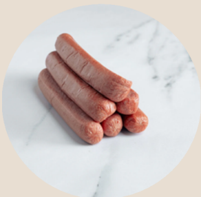
Hot Dog Skinless #780134, 6/5 lb Sabrett