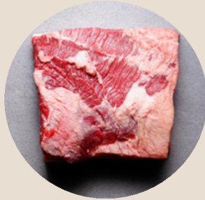
Beef Brisket Boneless #008046, 4/14 lb Copper Creek