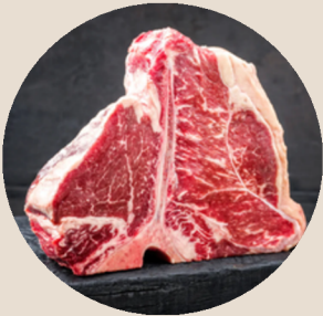
Beef Porterhouse Steak #871698, 2/48 oz The Cutshop