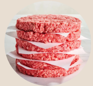
Beef Burger 80/20 Perfect Blend #908278, 20/8 oz The Cutshop