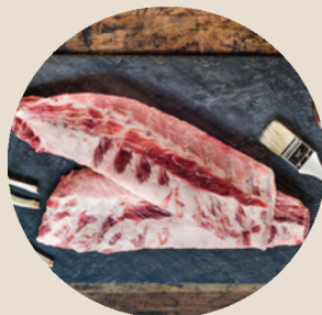
Pork Rib Baby Back #008804, 6/2 pc Leidys