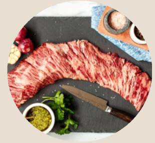
Beef Skirt Steak #091105, 6/6 pc Copper Creek