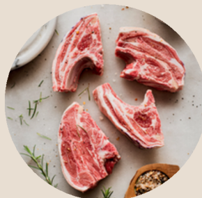
Lamb Chops Shoulder Portioned #870801, 20/4 oz The Cutshop