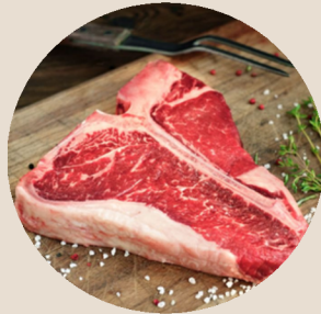
Beef T-Bone Steak Choice #871710, 10/16 oz The Cutshop