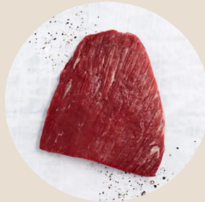
Beef Flank Steak #091067, 1/7-14 lb The Cutshop