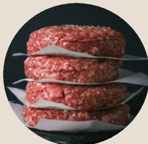
Beef Burger 80/20 Chuck & Ribeye #908284, 20/8 oz The Cutshop