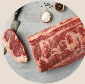
Beef Striploin Boneless #008119, 5/14-15 lb Copper Creek