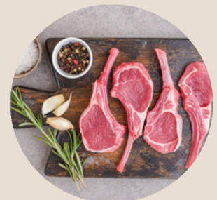
Lamb Rib Chop Frenched #963042, 80/2 oz Catelli