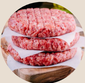
Beef Burger Chuck, Brisket, Short Rib #020272, 20/8 oz The Cutshop