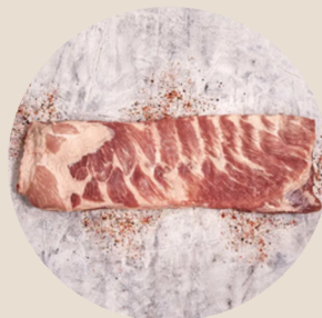
Pork Rib St. Louis #008874, 10/1 pc Leidys