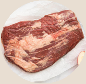
Boneless Beef Brisket #008041, 4/15-16 lbs Copper Creek