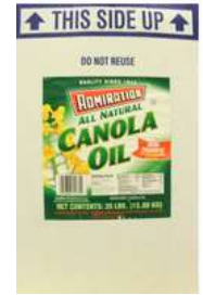
CANOLA OIL ZTF 1/35 lb - 353511