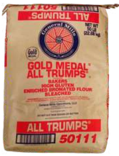
FLOUR HI GLUTEN 205010 - 1/50 LB