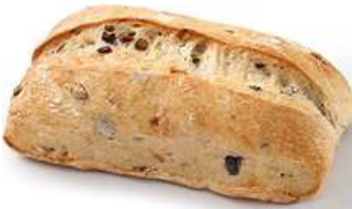
105 g / 3.7 oz (Baked)