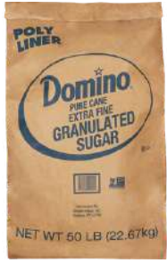
SUGAR GRANULATED XTRA FINE 495005 - 1/50 LB