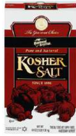
KOSHER SALT 433603 - 9/3 LB