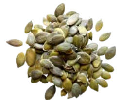
PUMPKIN SEEDS, RAW SHELLD 481044 - 1/5 LB