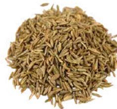
CARAWAY SEEDS 481255 - 12/1 LB*