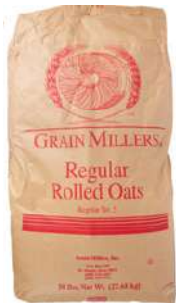
ROLLED OATS REGULAR 205022 - 1/50 LB