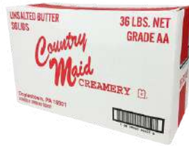
BUTTER UNSALTED 13613 - 36/1 lb