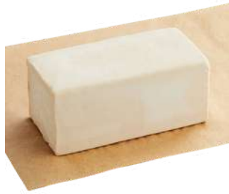
YEAST FRESH COMPRESSED 082002 - 24/1 LB