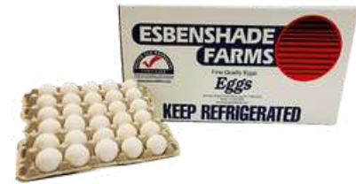
EGGS LARGE LOOSE 53002 - 1/30 DOZ