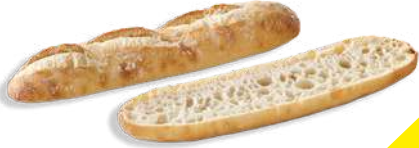
140G - 4.94 OZ (Baked)