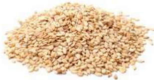
SESAME SEEDS WHITE HULLED 481120 - 4/5 LB