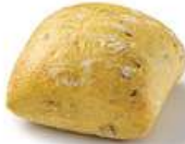
35 g / 1.2 oz (Baked)