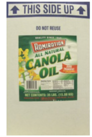
CANOLA OIL ZTF 1/35 lb - 353511