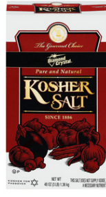
KOSHER SALT 433603 - 9/3 LB