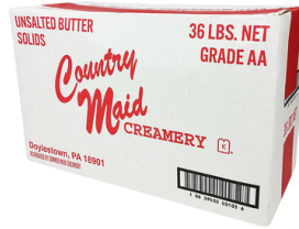
BUTTER UNSALTED 13613 - 36/1 lb