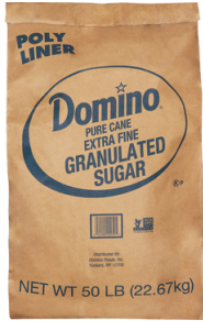
SUGAR GRANULATED XTRA FINE 495005 - 1/50 LB