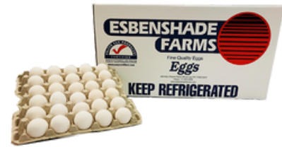
EGGS LARGE LOOSE 53002 - 1/30 DOZ