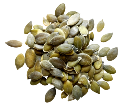
PUMPKIN SEEDS, RAW SHELLD 481044 - 1/5 LB