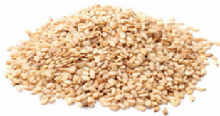
SESAME SEEDS WHITE HULLED 481120 - 4/5 LB