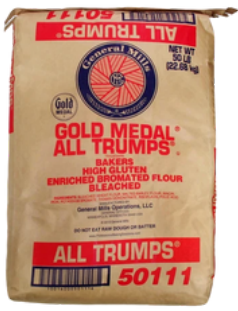
FLOUR HI GLUTEN 205010 - 1/50 LB