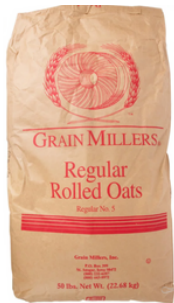
ROLLED OATS REGULAR 205022 - 1/50 LB