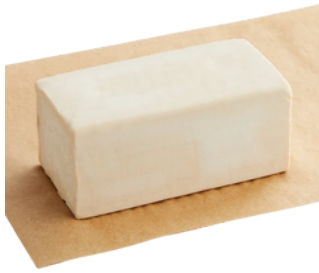
YEAST FRESH COMPRESSED 082002 - 24/1 LB