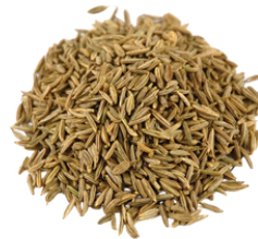
CARAWAY SEEDS 481255 - 12/1 LB*