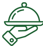
Catering & Banquet Halls