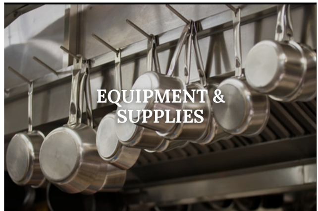
EQUIPMENT & SUPPLIES