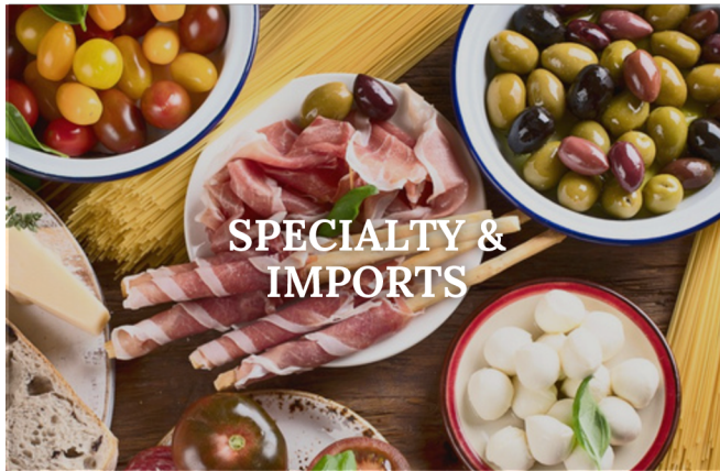
SPECIALTY & IMPORTS