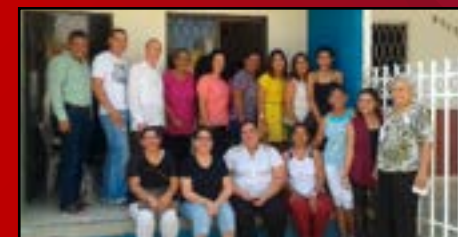
Santa Marta Missionary Baptist Church