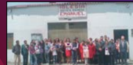
Emmanuel Missionary Baptist Church