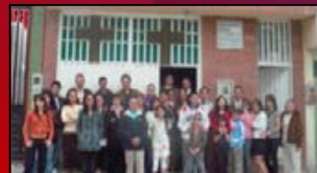
Peniel Missionary Baptist Church