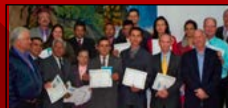
Colombia Theological Baptist Institute