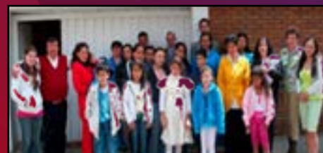
Bosa Missionary Baptist Church