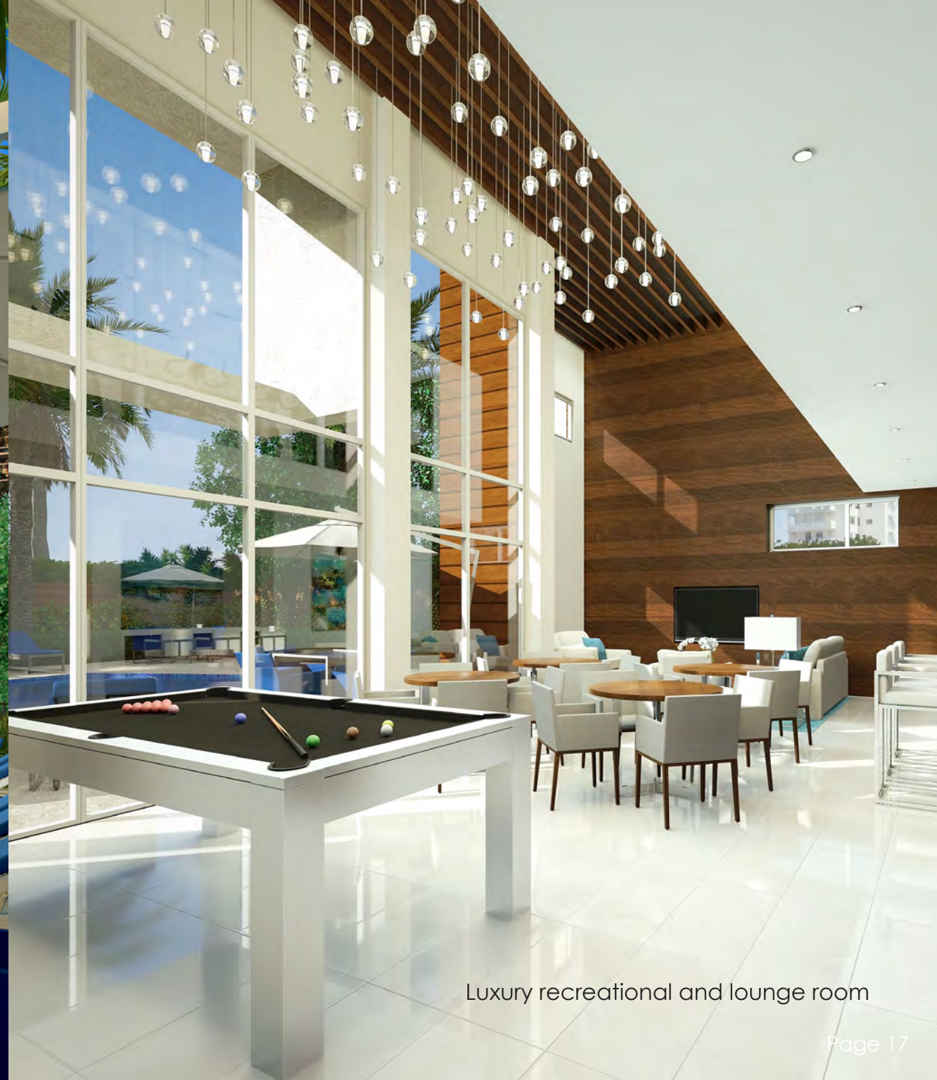
Luxury recreational and lounge room