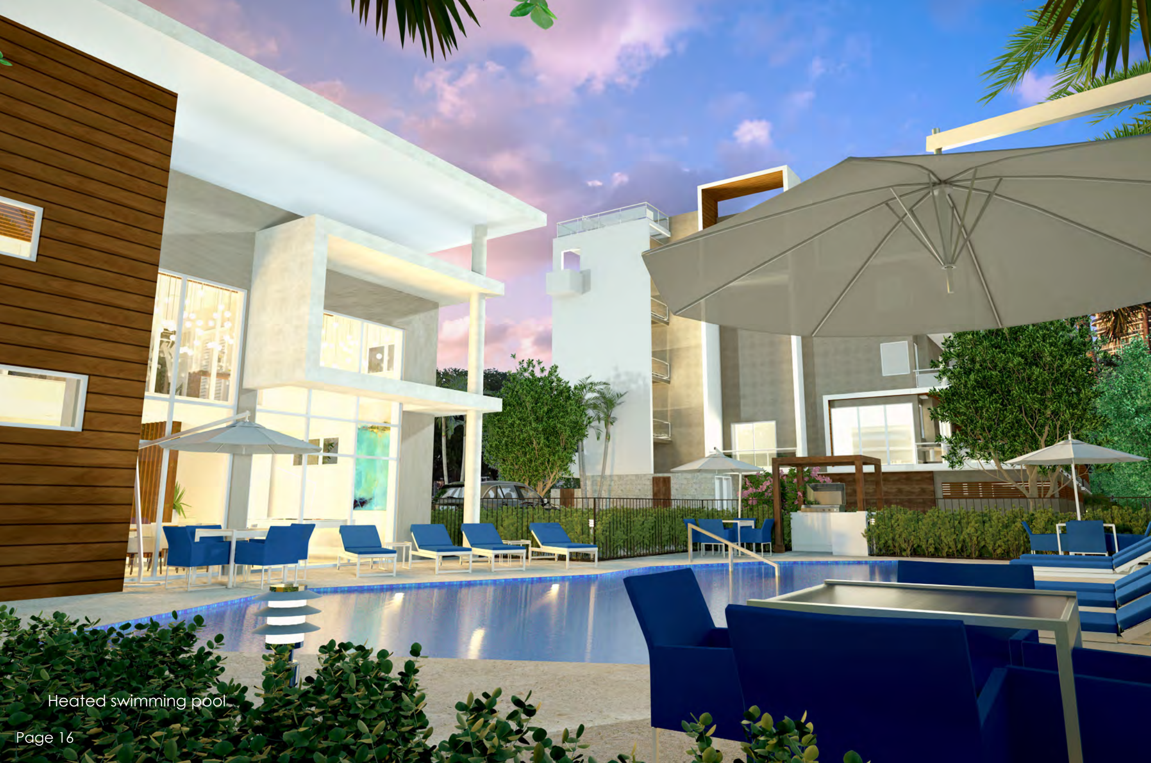
Heated swimming pool