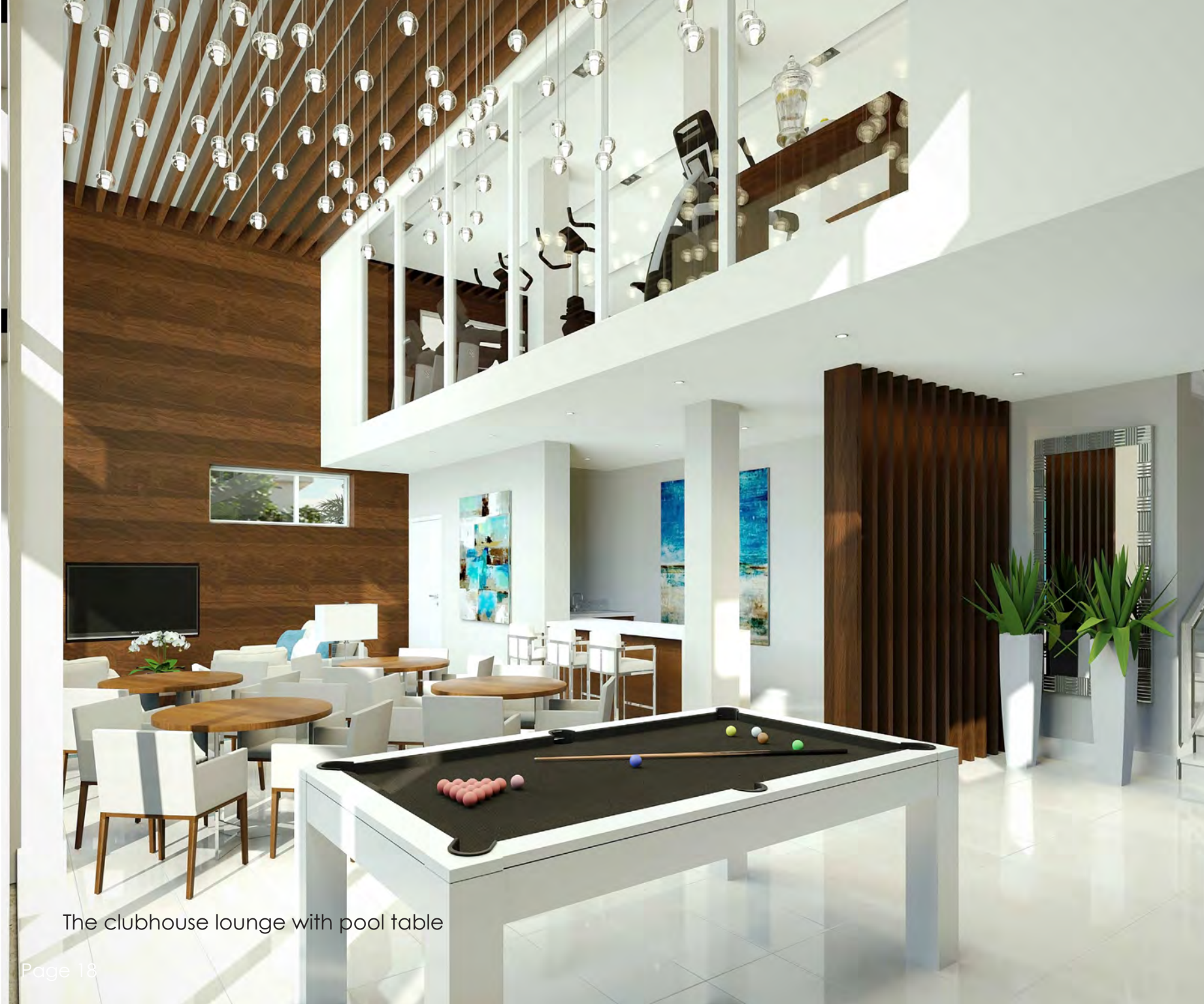
The clubhouse lounge with pool table