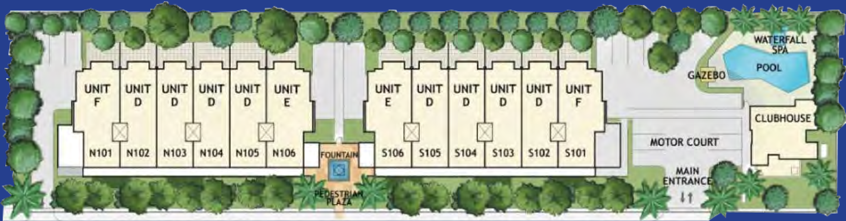
Lower level units (2nd & 3rd floors)