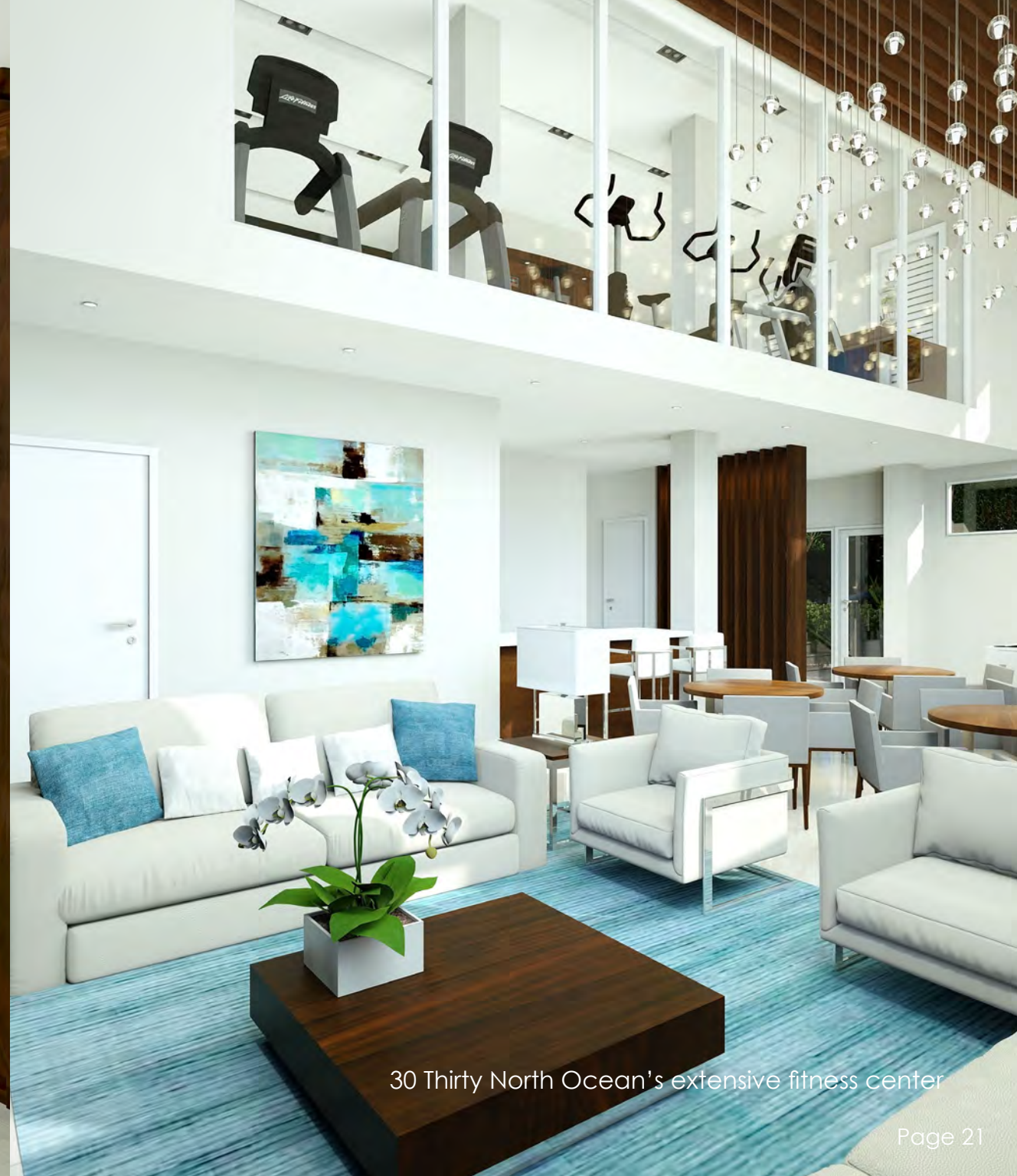
30 Thirty North Ocean's extensive fitness center