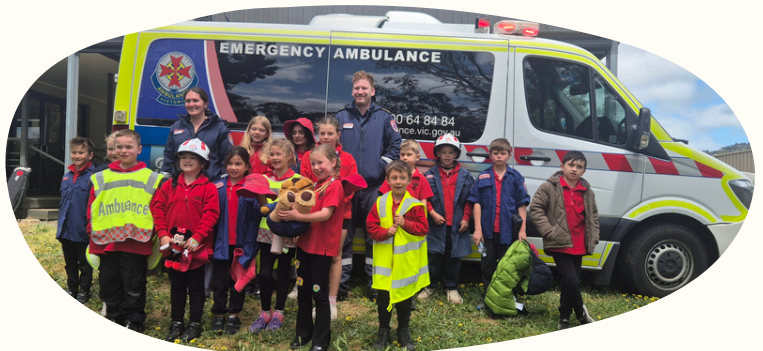
Group Photo Elmhurst Emergency Services Day