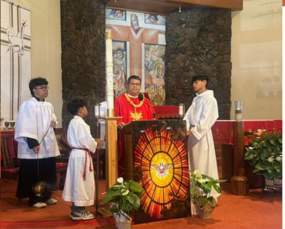
Mahalo for Reviving the Tradition of the Holy Ghost Feast