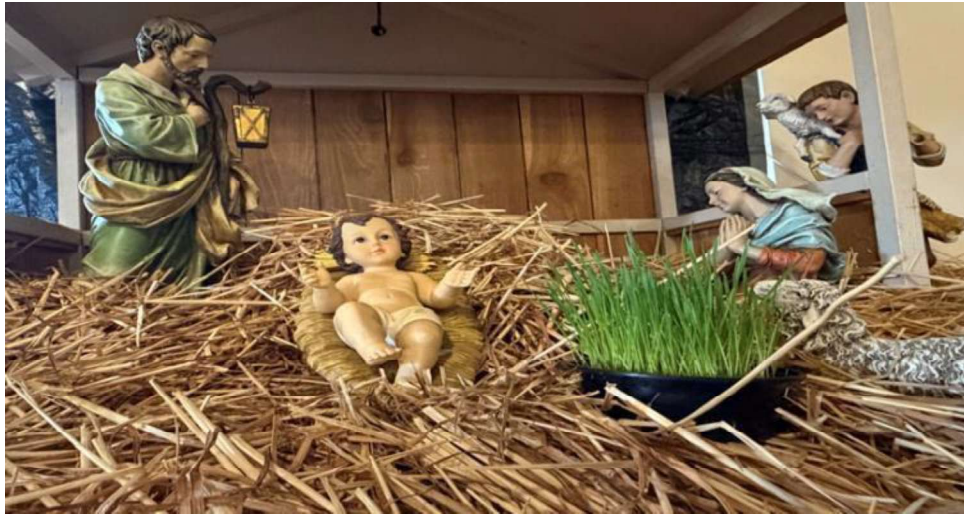
The crèche at St. Catherine of Alexandria Church, adorned with wheat grass—a Portuguese Christmas tradition symbolizing the Eucharist, the Bread of Life, and God's promise of blessing and new life.

Every year, the Sunday after Christmas is dedicated to the Feast of the Holy Family of Jesus, Mary, and Joseph—the holiest family that ever was and ever will be. As we continue to rejoice in the birth of our Savior, this feast invites us to pause and reflect on our own families and how we are called to grow in love, faith, and unity by imitating the Holy Family.