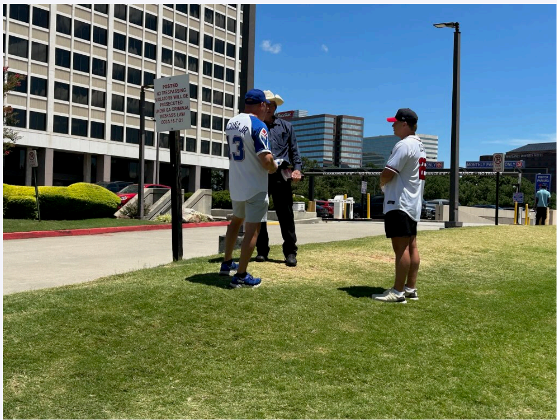
View of Bridge Ministry location from preaching location.