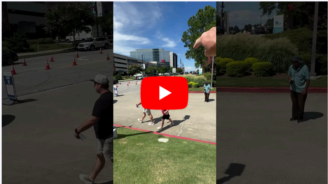
View of Bridge Ministry location from underneath bridge showing the corner where fans could cross the street.