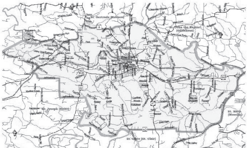
Immaculate Conception - Union Parish Map

People living outside this area are welcome to join Immaculate Conception Parish after consultation with their proper pastor.