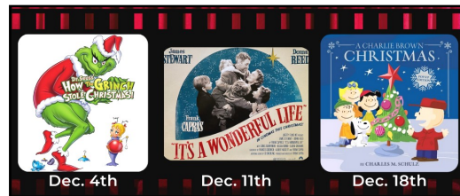
“Advent at the Movies”

Shortly after Christmas, the Worship Team began Lenten service planning. On Wednesday evenings we held soup suppers and evening prayer services that invited us to be “purveyors of awe” by exploring themes in Scripture including wonder, meaning, curiosity, delight, and connection.