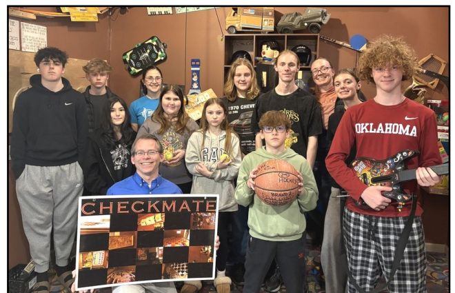
Youth trip to the Escape Room— we almost got out!