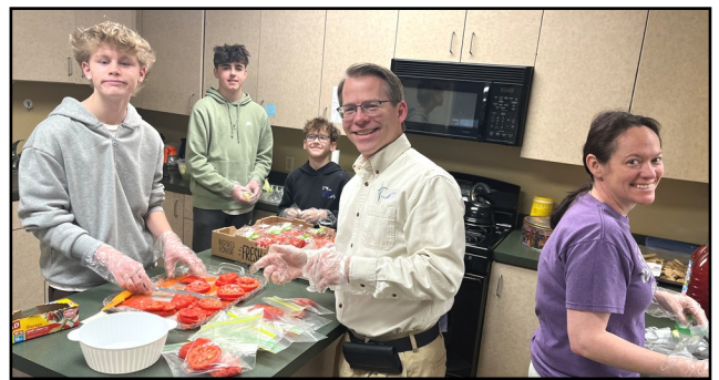
(left) Mini-golf and ice cream at Uncle Ray's (center & right) Making Super Bowl Subs We raised $700! Thank you!