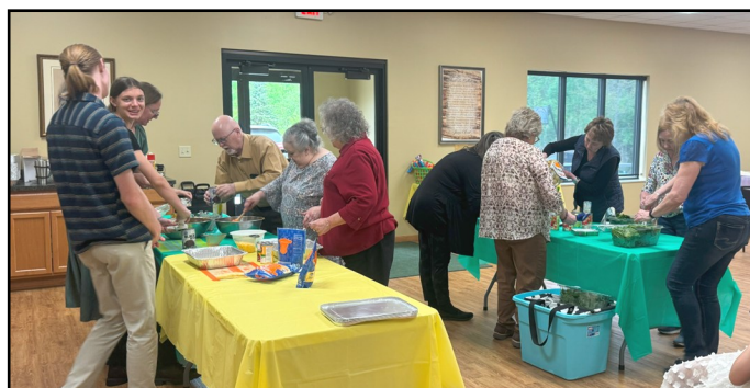
(left & right) Serving at our food distributions—Thank you! (center) Making meals for Clara's Hope foster families