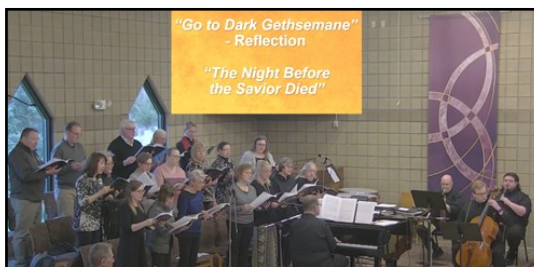
“Not My Will But Yours” Cantata on Maundy Thursday