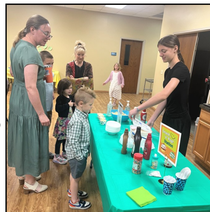
(above) End of Sunday School party - making ice cream sundaes! (below) The Choir at Easter