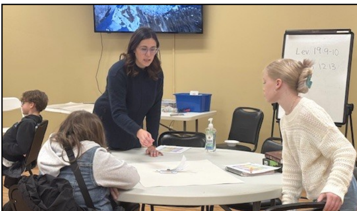
Learning during Confirmation Class