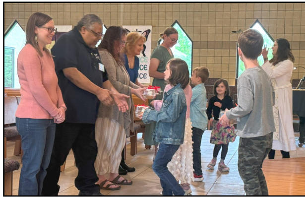
(center) Recognition of Sunday School Teachers (left & right) Easter egg hunt fun and games!