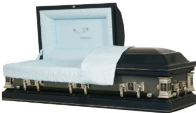
In God's Care