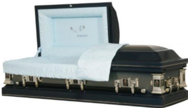
In God's Care