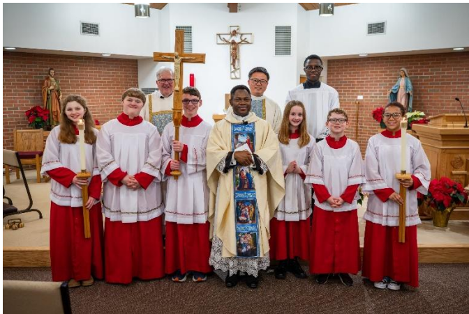
Christmas Eve Mass