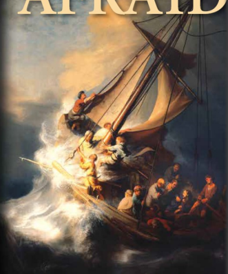
Christ in the Storm on the Sea of Galilee by Rembrandt

The 7th Annual Be A Catholic Man Conference will be held on Saturday, October 8, 2022 at Holy Redeemer High School, 159 South Pennsylvania Ave. Wilkes Barre, PA 18701.