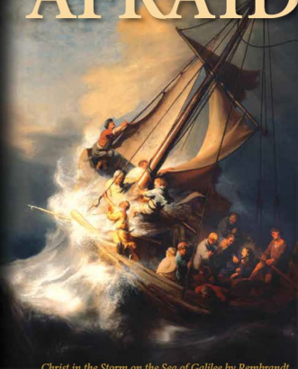
Christ in the Storm on the Sea of Galilee by Rembrandt

The 7th Annual Be A Catholic Man Conference will be held on Saturday, October 8, 2022 at Holy Redeemer High School, 159 South Pennsylvania Ave. Wilkes Barre, PA 18701.