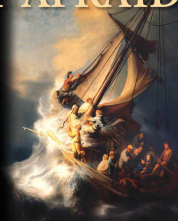
Christ in the Storm on the Sea of Galilee by Rembrandt