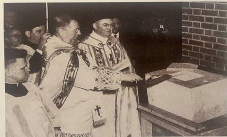
Cornerstone, St. Paul's Church, 1951