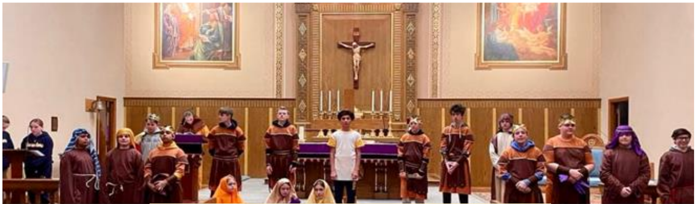
7th Grade Students practicing inside St. Paul Church