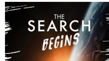
Youth Faith Formation