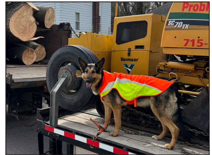
Meet Kenzie, the Safety Dog!

Quality Tree Service is working in your area now - call today for an estimate on the work you need done. We do it all safely and efficiently with minimal ground damage. Wood can be left for firewood, or chipped up and hauled to local nurseries for mulch. We are the very best at what we do.