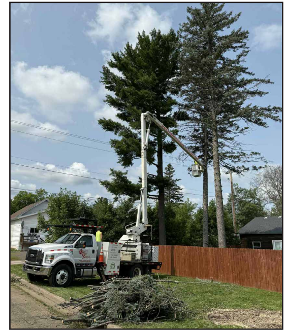
75' working height bucket truck