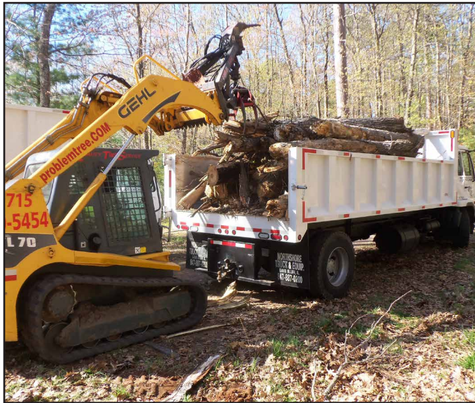
General clean up of old rotten trees and stumps.