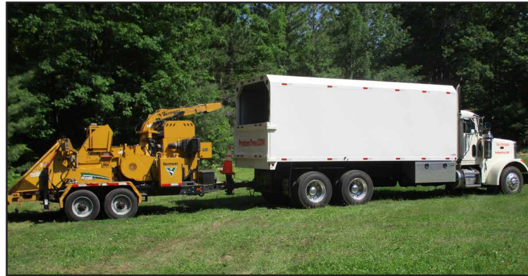
Our large capacity chipper takes up to 20" diameter, which makes quick work out of clean up.