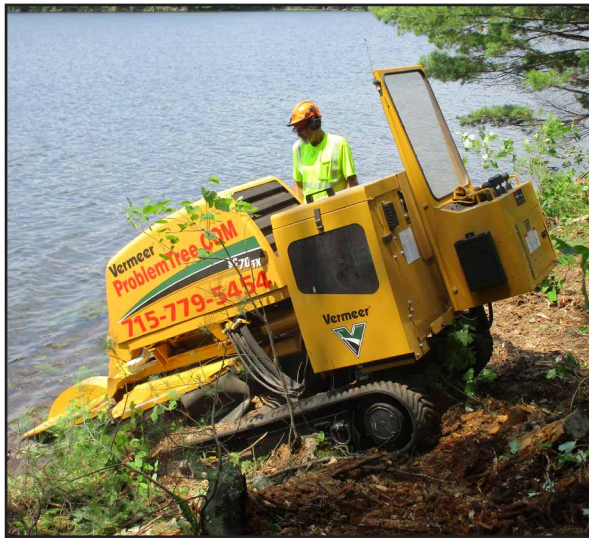
Portable stump grinder with remote control. Easy to work in hard to get places.