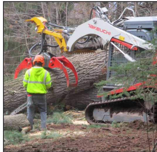
TREE REMOVAL Large and Difficult