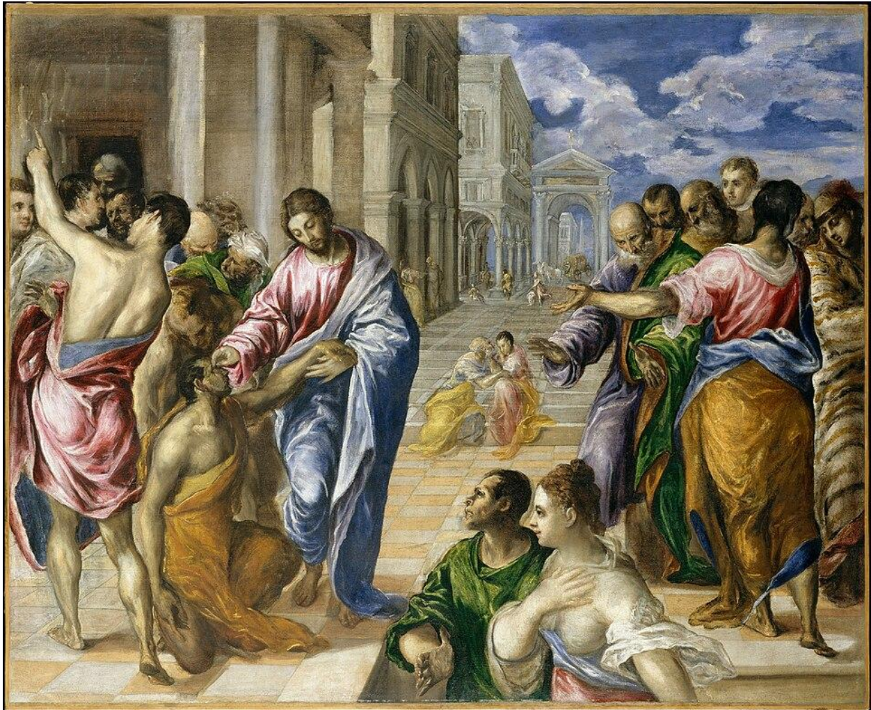
Christ Healing the Blind – El Greco (1541 – 1614)

Third Sunday of Advent December 14, 2025 10:00am