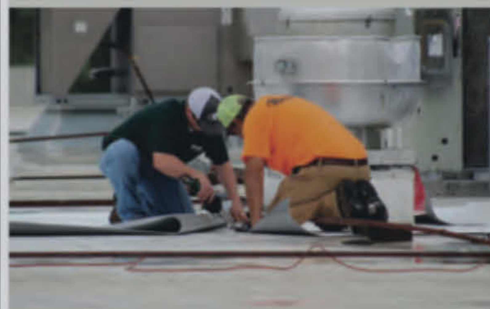
NEW ROOF PENETRATIONS