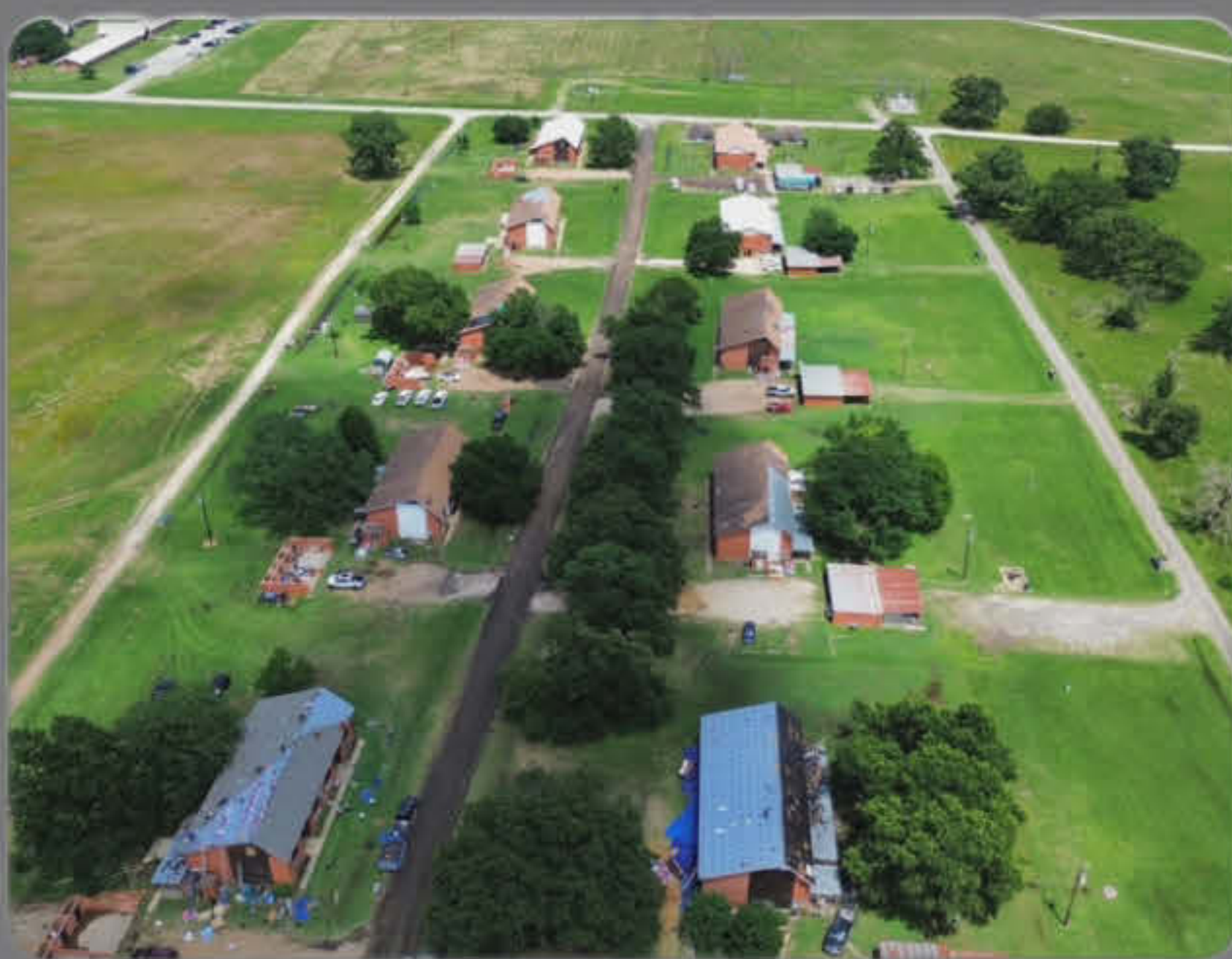
Shingle Replacement (TDCJ Guard Facilities)

Our roofing service specializes in providing high-quality roofing solutions tailored to meet the specific needs of our clients. With a focus on reliability and craftsmanship, REVIV offer a range of services including new installations, repairs, and maintenance for various roofing types, ensuring customer satisfaction and long-lasting results. REVIV's experienced team is committed to using top-grade materials and employing the latest industry techniques to deliver exceptional service and a durable roof that protects homes and businesses