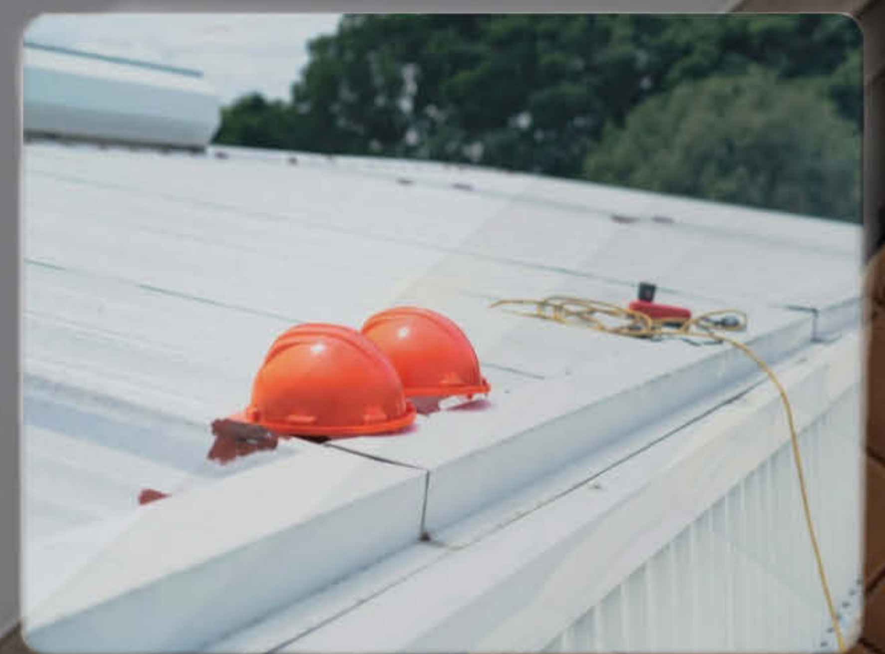
Metal Roof Replacement