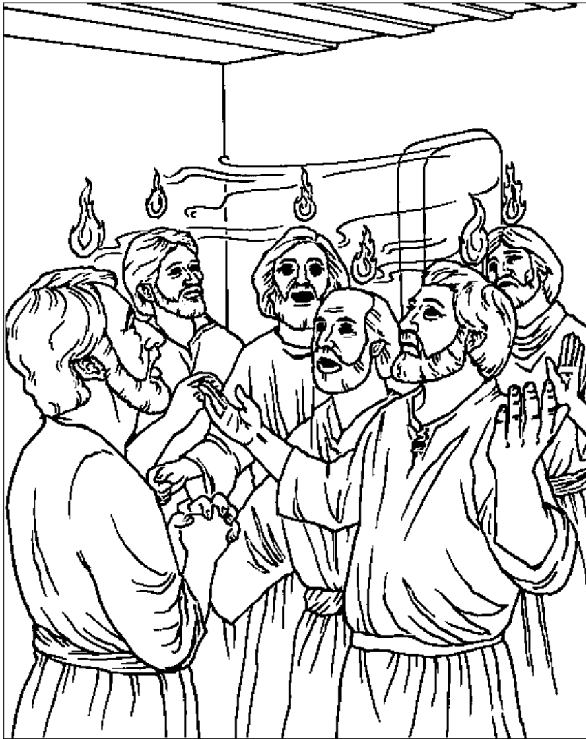
The Day of Pentecost Acts 2