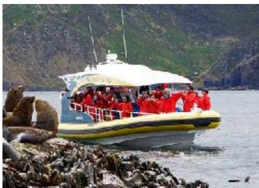
Bruny Island Wilderness Cruise