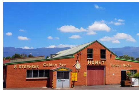
R. Stephens Tasmanian Honey

At Binalong Bay we will stroll along the pure white sandy beaches and snap photos of possibly the most colorful spot on the island. Sample fresh oysters from a working oyster farm as an afternoon snack. Next we proceed towards Launceston stopping at Pyengana, the award-winning dairy for some tastings of delicious cheese. We then twist our way through an ancient Myrtle Rainforest and cross the trail of the dragon, an old mining area centered around the town of Derby. The carved memorial trees at Legerwood are one of Australia most unique & tasteful memorial sites, this will be our tea & coffee break for today before arriving in Launceston CBD for our evening lodgings.