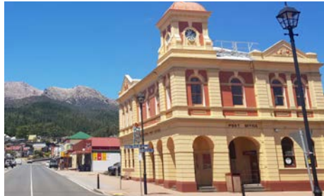
Queenstown Post Office

as Zeehan and view the Southern Ocean from one of the best lookout points on the west coast – how far can you see – perhaps Argentina? This is some of the freshest air on Earth. Arriving in the historic settlement of Strahan we see the historic train station at Regatta Point, visit an old though still operational saw mill and the award winning Woodcraft Centre with beautifully designed woodworks on display. Continue on to our evening lodgings at the infamous west coast township of Queenstown .