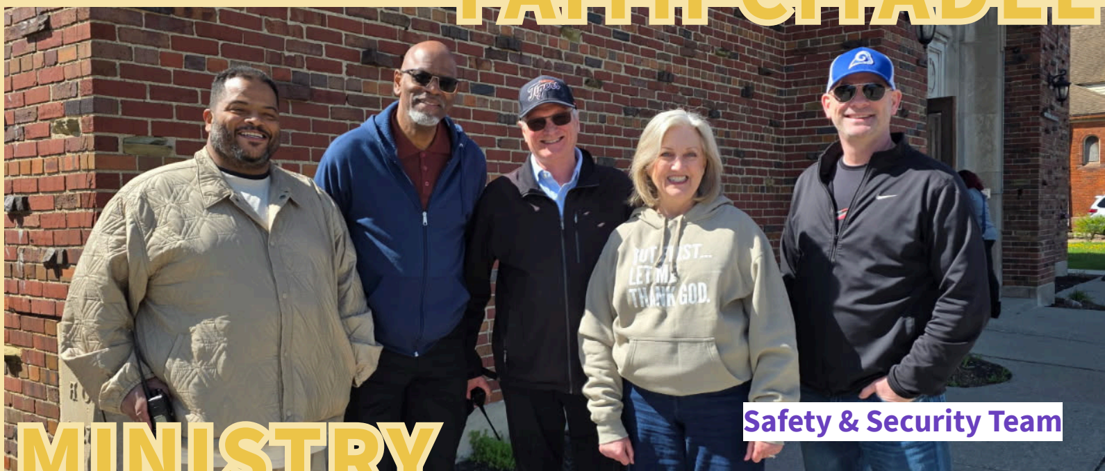
Safety & Security Team