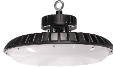
FR50 VO Polycarbonate Drop Lens

The CircLED™ high bay is a high-performance lighting solution for industrial and commercial use. Constructed from a thermally conductive molded polymer, its design offers a lighter alternative to traditional die-cast fixtures while ensuring optimal thermal management. An IP65-rated fixture protects the unit from dust and water jets, providing long-term durability in environments.