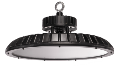
Clear VO Polycarbonate Flat Lens