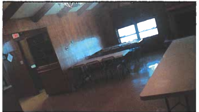
Serving Area Seating