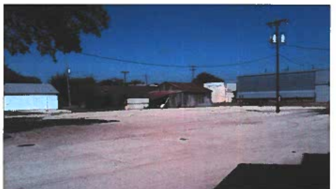
48 Car Parking Area