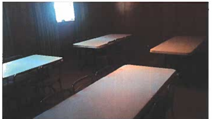
Master Bedroom Seating