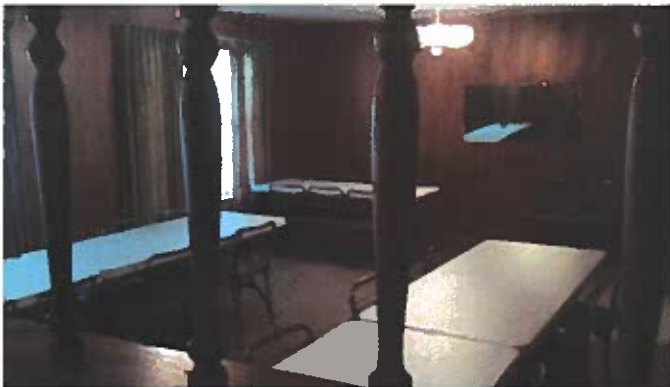
Living Room Seating