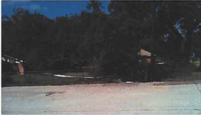
Parking Lot Entrance to Sidewalk