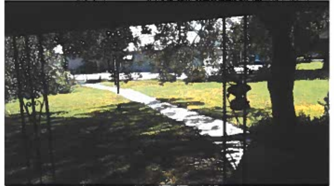
Entrance Looking back to East