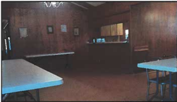
Serving Area Looking towards Kitchen